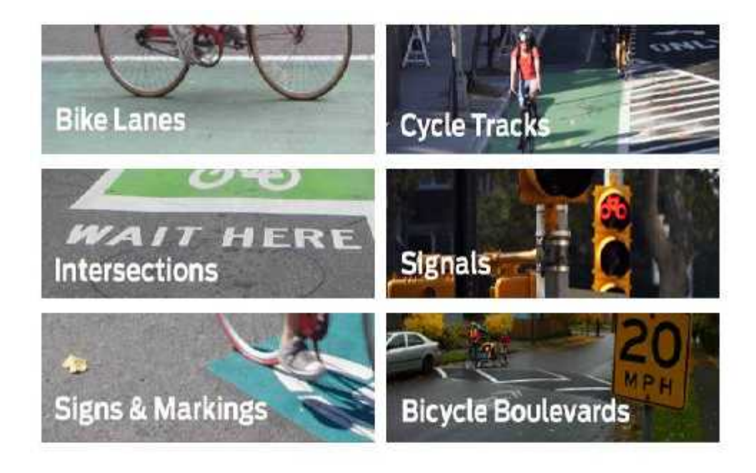
Figure 1 - Toolbox example improvements

http://bendoregon.gov/modules/showdocument.aspx?documentid=17952 or you can review bendoregon.gov/growth under Transportation Planning Program with the Multimodal Safety Program for more information.