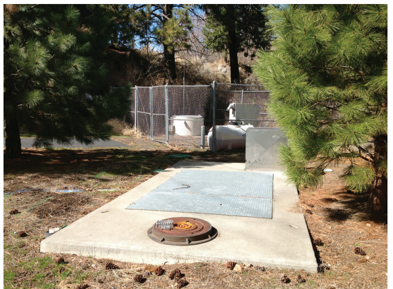
Shevlin station is too small, has occasional odor problems, and is in need of repair.

Bend has provided citywide sewer services since 1980.