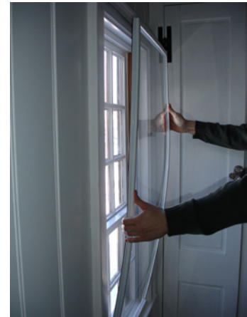
Interior storm panel.

Several retrofit measures perform as well as new replacement windows. Specifically, interior window panels, exterior storm windows and cellular blinds essentially match the energy savings of new, efficient replacement windows. (See energy savings comparison chart on Page 3.)