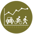
TRAFFIC COUNT DATA