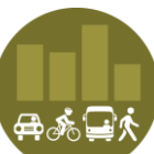
COMMUTER MODE SHARE