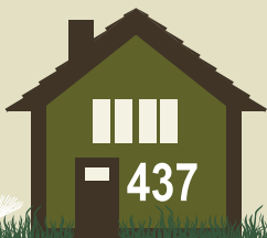
Odd Water Days