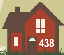
Even Water Days