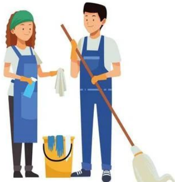
Two parents working full-time at minimum wage jobs