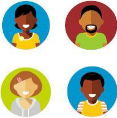
Four Homebuyers Today