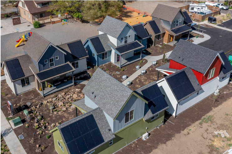
5 units completed