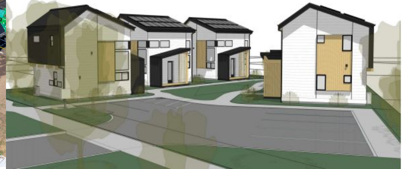
5 units under construction