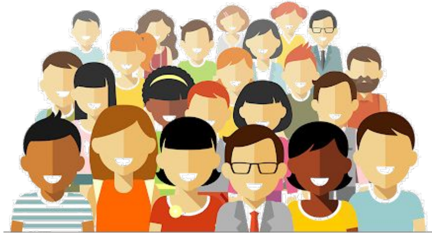
Future Homebuyers of Resales