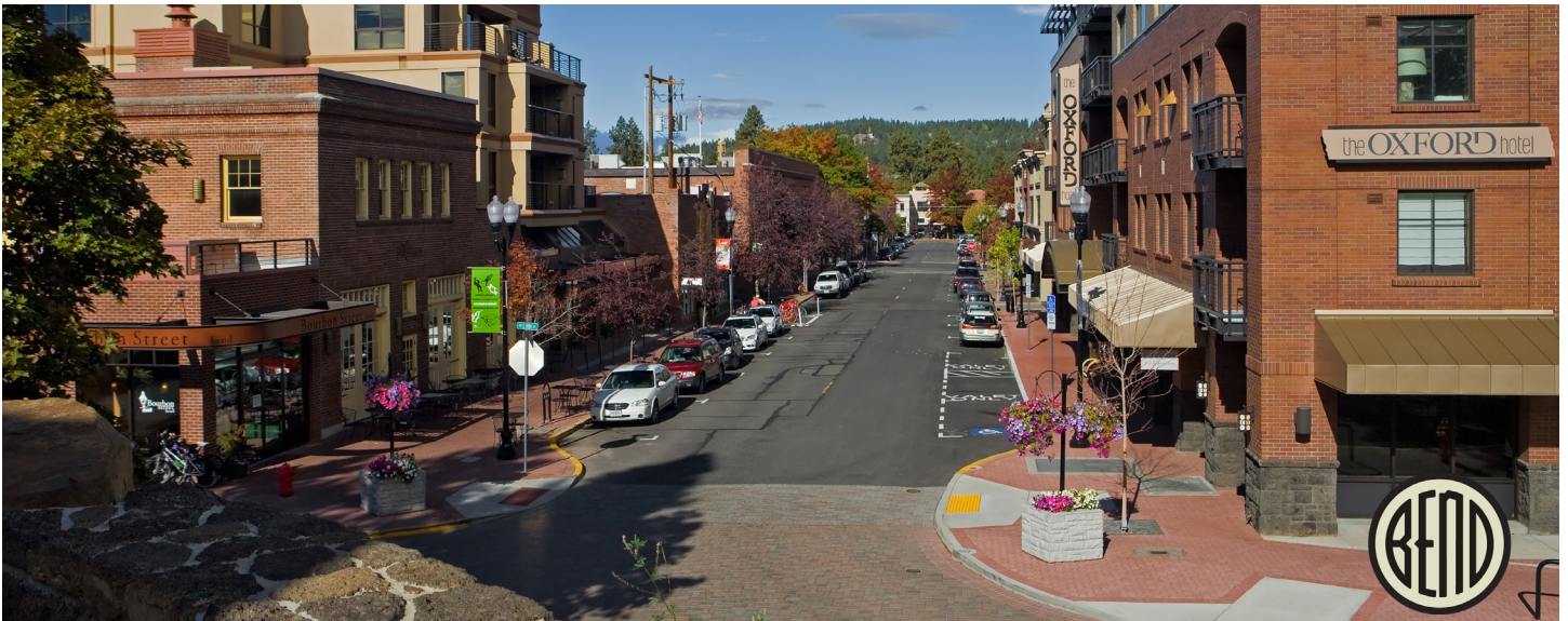
Walkable Downtown Bend