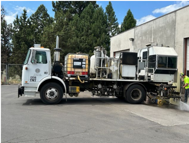
Old Striping Truck

One of the latest major advancements in technology for this truck is the data acquisition systems, or paint and bead monitoring systems. Data acquisition systems give the operator a real-time readout of what they are putting down, such as gallons of paint being applied per mile and glass beads per gallon of paint. This is huge for the City in so many ways including historical data, planning and budgeting. Other advancements today hit almost every system on this truck: line guides (multi line applications), mechanical systems, optics, military grade lasers, video with DVR, and more!