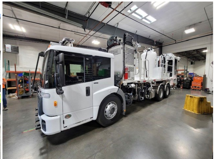
New Striping Truck