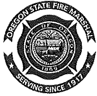
Exhibit A to Engine Program Intergovernmental Agreement