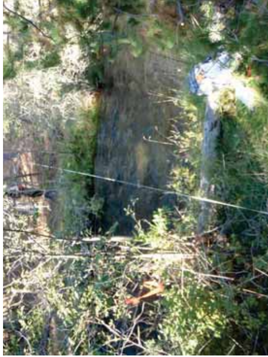
Figure 146. R B: Transect 6 Glide – From left bank head pin looking to right bank.