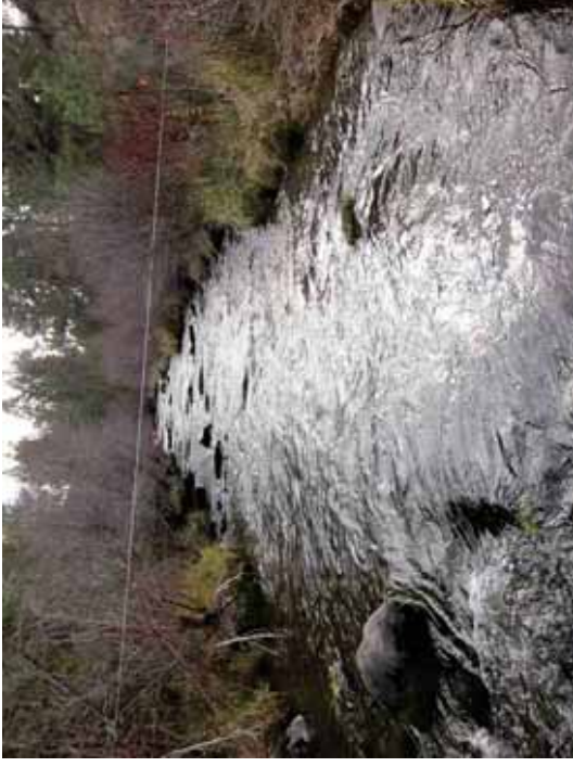
Figure 201. R B: Transect 4 Riffle – From 20' downstream looking upstream.