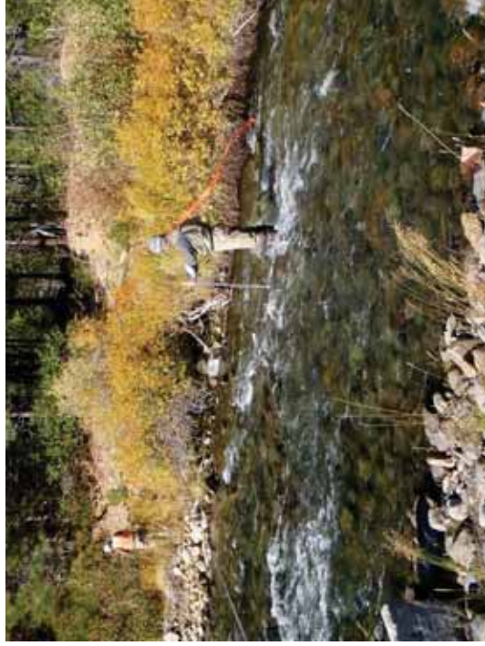
Figure 44. SR A1-RR: Transect 4 Riffle – From left bank near water's edge looking to right bank.