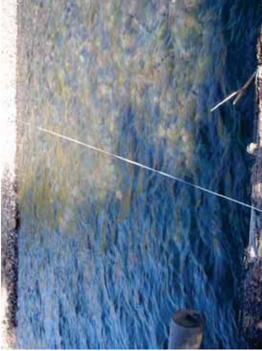
Figure 38. SR A1-RR: Transect 6 Riffle – From left bank water's edge looking to right bank water's edge.