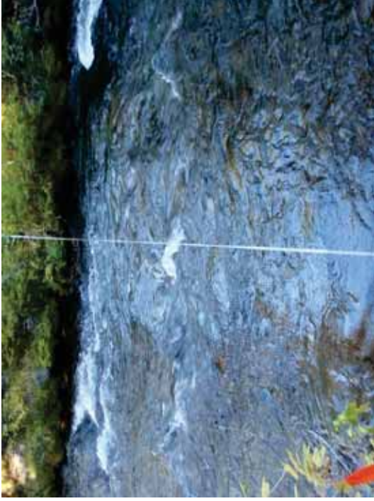
Figure 72. SR A1-RB: Transect 4 Rapid – From left bank water's edge looking to right bank.