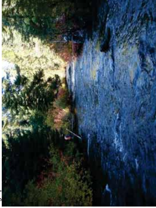
Figure 78. SR A1-RB: Transect 2 Riffle – From 30' downstream looking upstream.