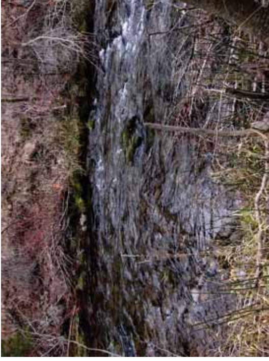
Figure 193. R B: Transect 7 Riffle – From right bank looking to left bank.