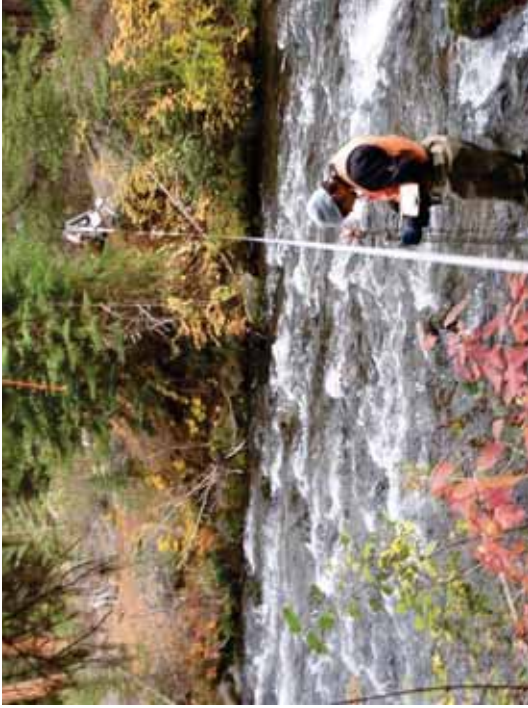
Figure 88. SR A1-RB: Transect 6 High Gradient Riffle – From left bank water's edge looking to right bank.