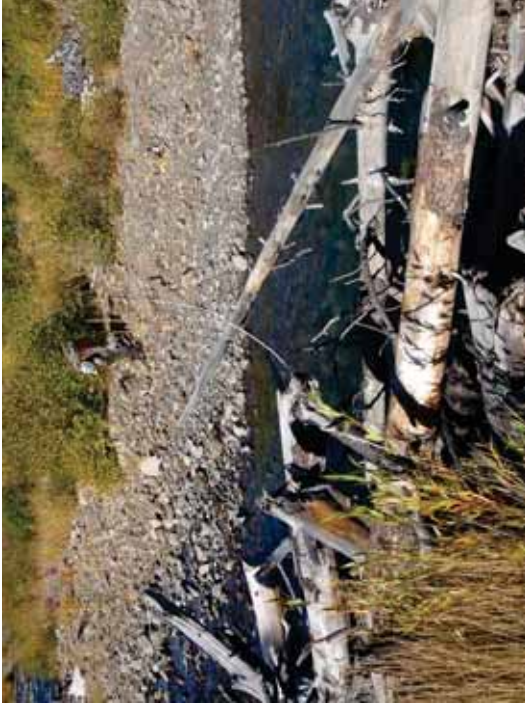
Figure 42. SR A1-RR: Transect 5 Pool – From left bank head pin looking to right bank.