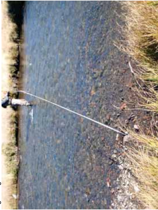
Figure 49. SR A1-RR: Transect 3 Riffle – From right bank water's edge looking to left bank.