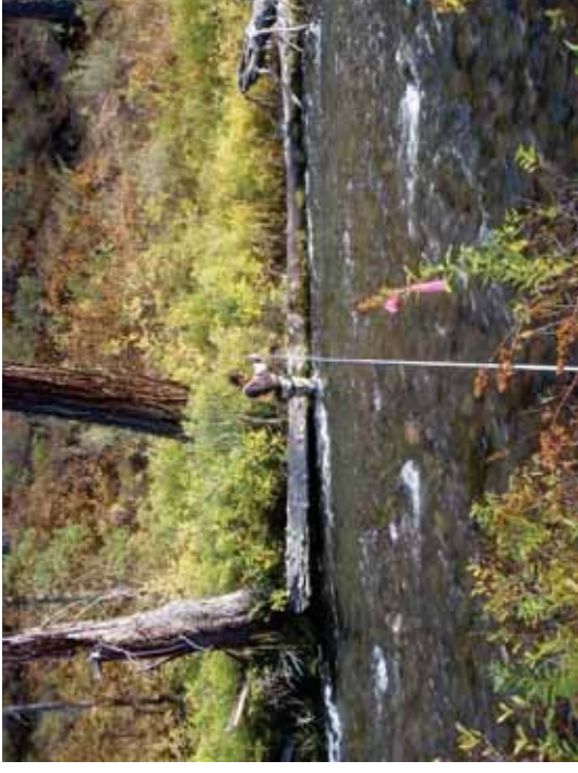
Figure 131. SR A2: Transect 3 Riffle – From right bank looking to left bank.