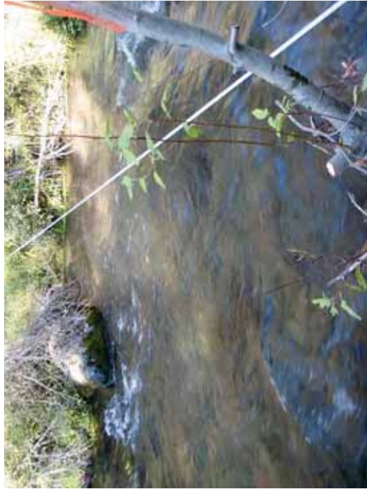
Figure 140. R B: Transect 8 Pool – From left bank water's edge looking to right bank.