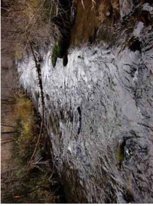
Figure 189. R B: Transect 8 Pool – From 20' downstream looking upstream.