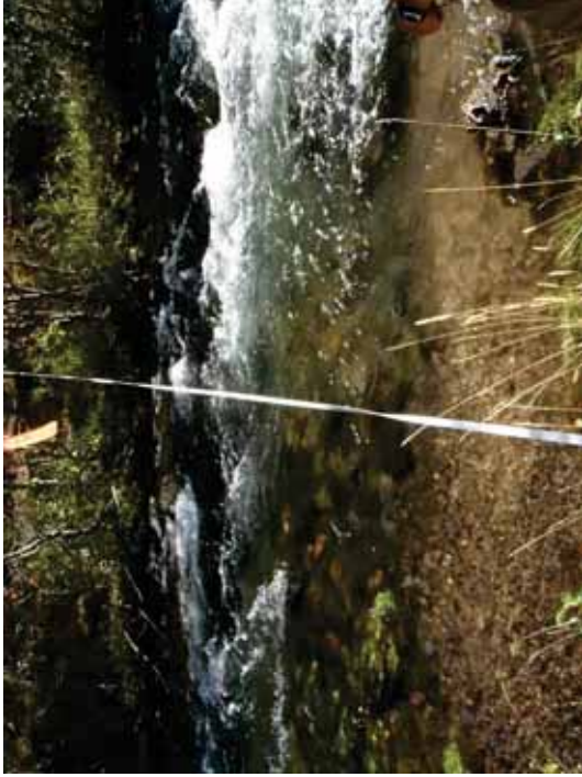
Figure 156. R B: Transect 3 Riffle – From right bank water's edge looking to left bank.