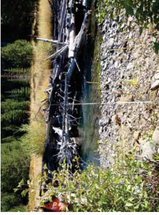
Figure 14. SR A1-RR: Transect 5 Pool – From right bank tail pin looking to left bank.