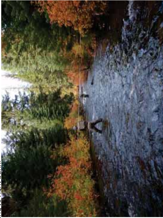
Figure 102. SR A1-RB: Transect 1 Riffle – From 20' downstream looking upstream.