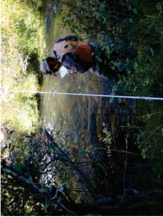
Figure 160. R B: Transect 2 Riffle – From left bank looking to right bank.