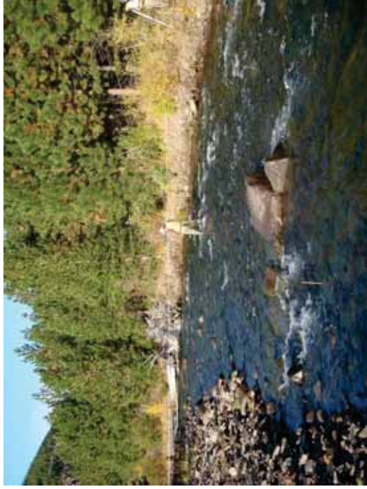
Figure 36. SR A1-RR: Transect 7 Riffle – From 30' downstream looking upstream.