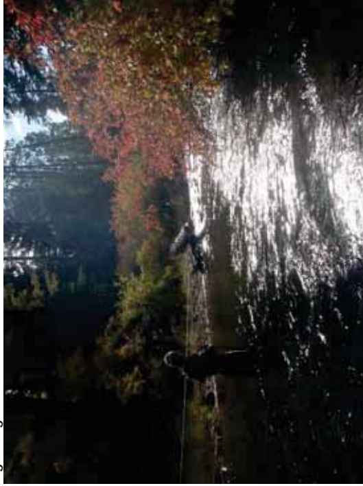
Figure 124. SR A2: Transect 6 Lateral Pool – From 10' downstream looking upstream.