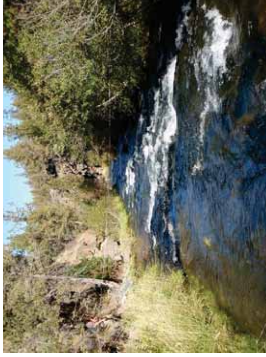
Figure 155. R B: Transect 3 Riffle – From 30' upstream looking downstream.