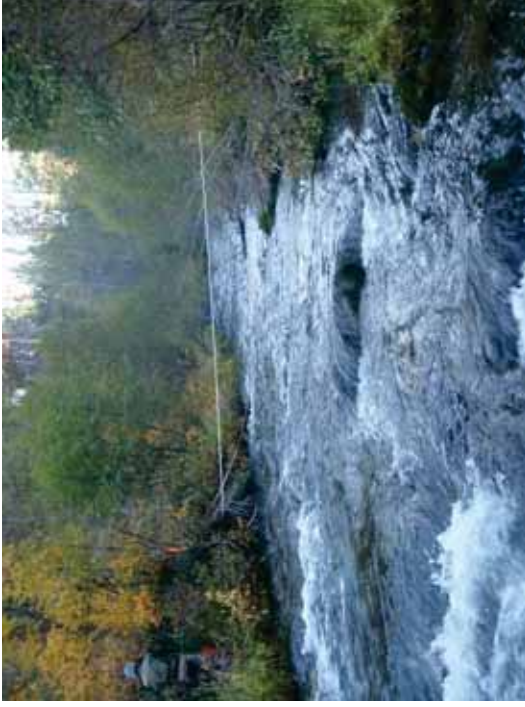
Figure 165. R B: Transect 8 Pool – From 20' downstream looking upstream.