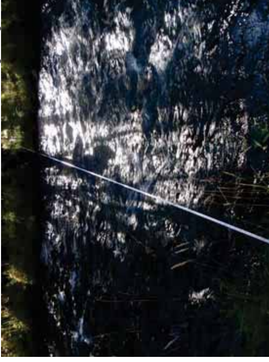
Figure 175. R B: Transect 5 Riffle – From right bank water's edge looking to left bank.