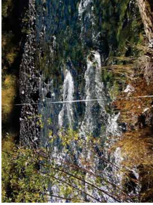
Figure 8. SR A1-RR: Transect 7 Riffle – From right bank looking to left bank.