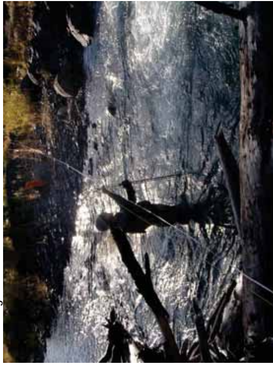
Figure 33. SR A1-RR: Transect 8 Pool – From right bank water's edge looking to left bank.