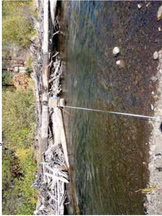
Figure 52. SR A1-RR: Transect 2 Pool – From left bank water's edge looking to right bank.