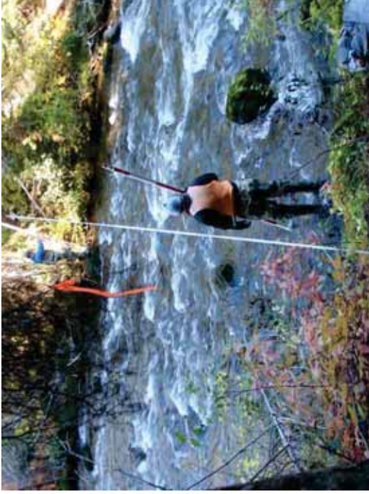
Figure 68. SR A1-RB: Transect 6 Riffle – From left bank looking to right bank.