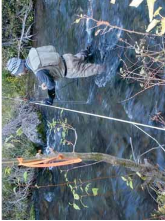
Figure 166. R B: Transect 8 Pool – From left bank water's edge looking to right bank.