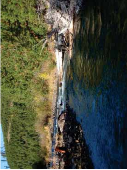
Figure 34. SR A1-RR: Transect 8 – From 30' downstream looking upstream.