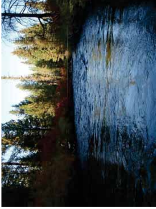
Figure 107. SR A2: Transect 5 Low Gradient Riffle – From 30' upstream looking downstream.