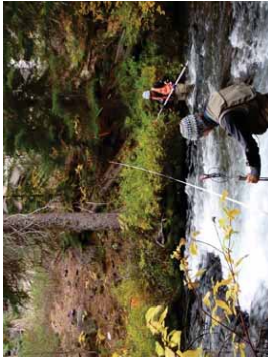
Figure 97. SR A1-RB: Transect 3 Plunge Pool – From left bank water's edge looking to right bank.