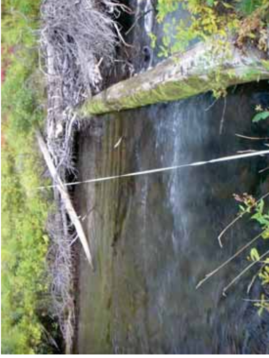
Figure 117. SR A2: Transect 2 Pool – From right bank water's edge looking to left bank.