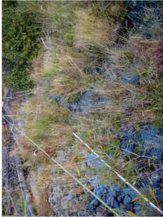
Figure 30. SR A1-RR: Transect 8 Side Channel – From left bank of side channel looking to right bank of side channel.