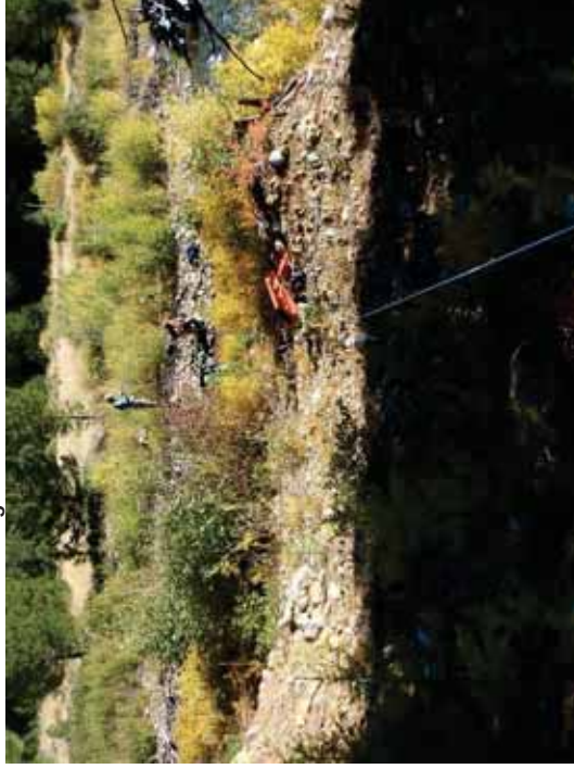
Figure 19. SR A1-RR: Transect 4 Riffle – From right bank tail pin looking toward left bank.