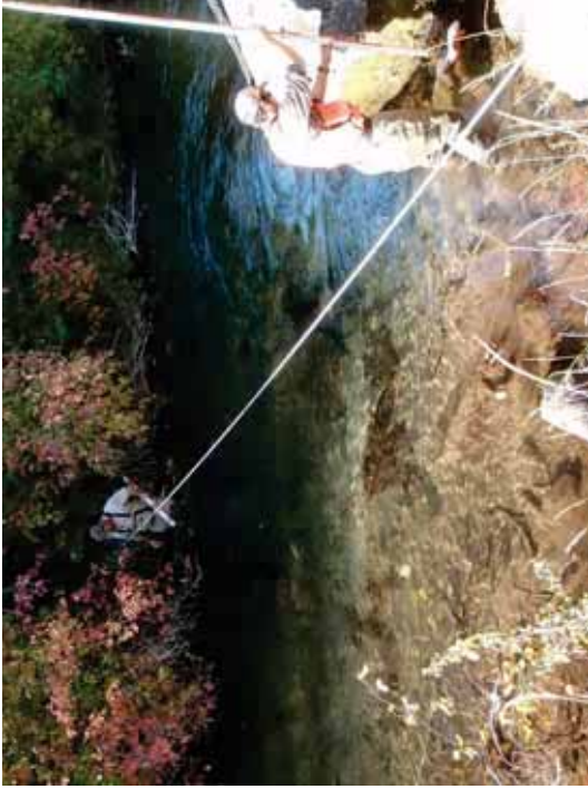
Figure 104. SR A2: Transect 6 Lateral Pool – From left bank looking to right bank.