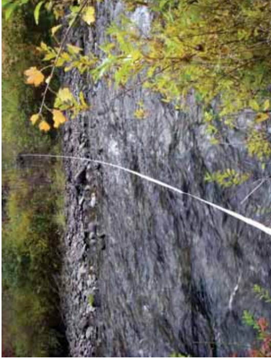
Figure 121. SR A2: Transect 1 Riffle – From right bank water’s edge looking to left bank.