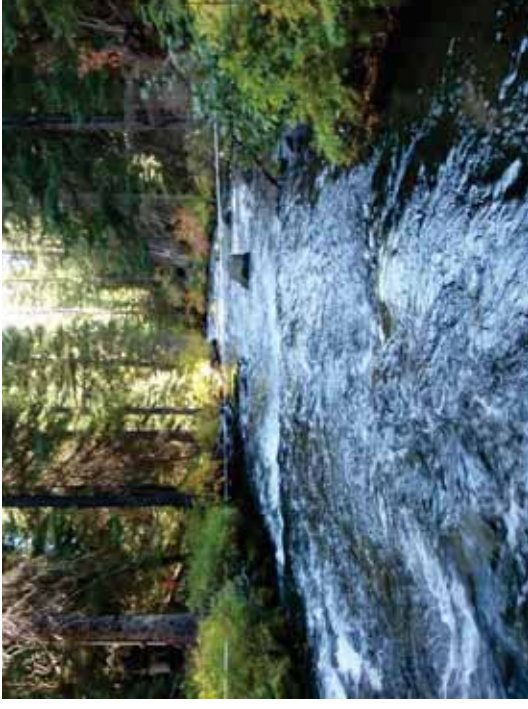
Figure 73. SR A1-RB: Transect 4 Rapid – From 30' upstream looking downstream.