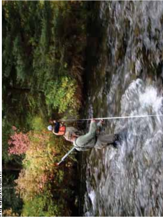
Figure 98. SR A1-RB: Transect 2 Riffle – From right bank water's edge looking to left bank.