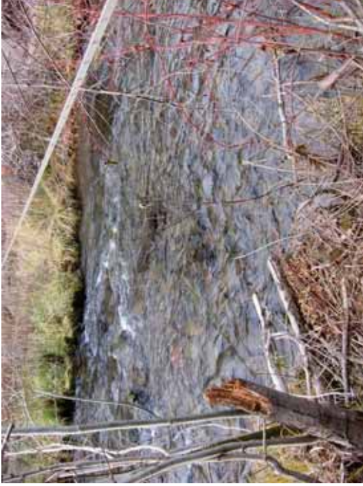
Figure 200. R B: Transect 4 Riffle – From left bank water's edge looking to right bank.