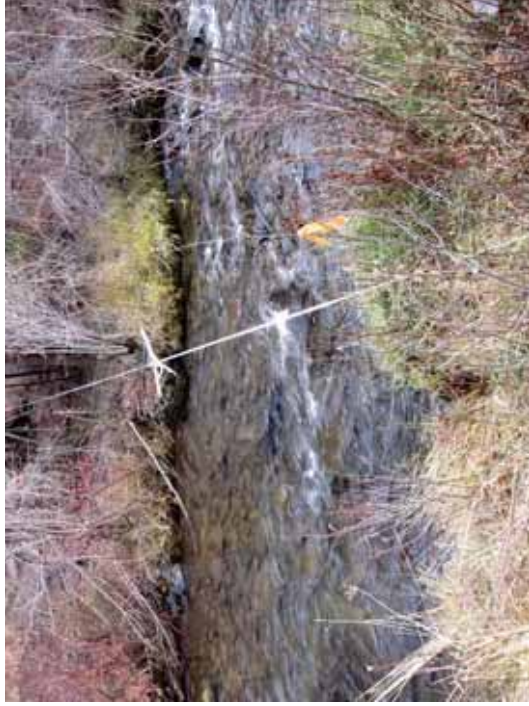
Figure 202. R B: Transect 4 Riffle – From right bank looking to left bank.