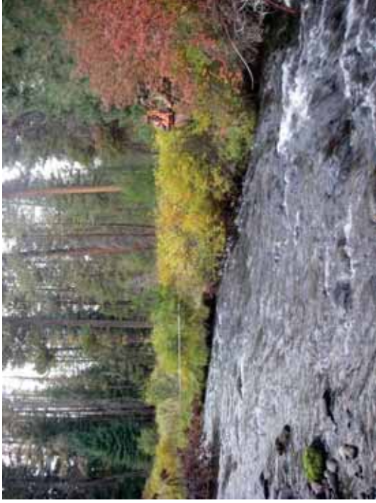
Figure 120. SR A2: Transect 1 Riffle – From 20’ downstream looking upstream.