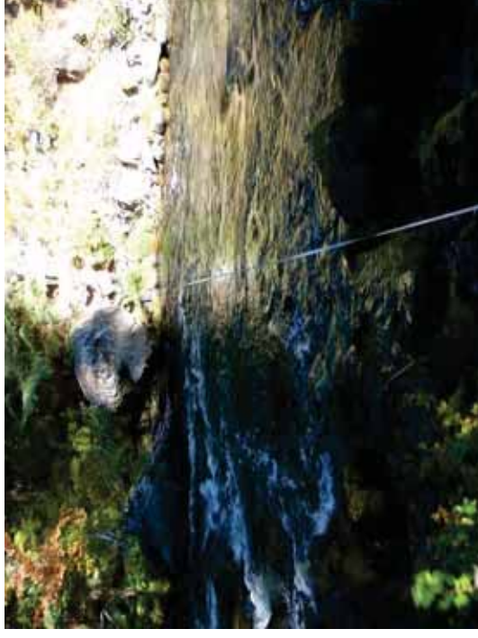
Figure 63. SR A1-RB: Transect 7 Pool – From left bank looking to right bank.