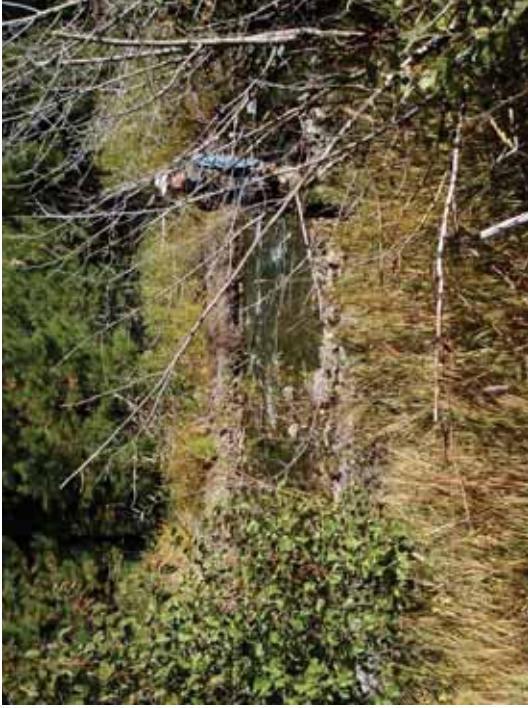
Figure 5. SR A1-RR: Transect 7 Riffle – From left bank head pin looking to right bank.