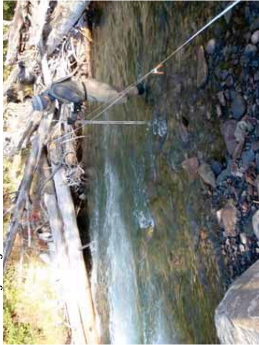
Figure 32. SR A1-RR: Transect 8 Pool – From left bank water's edge looking to right bank.