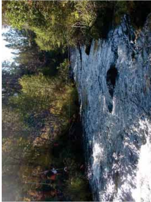
Figure 142. R B: Transect 8 Pool – From 25' downstream looking upstream.