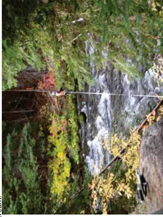
Figure 87. SR A1-RB: Transect 6 High Gradient Riffle – From right bank looking to left bank.