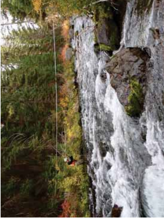
Figure 89. SR A1-RB: Transect 6 High Gradient Riffle – From 30' downstream looking upstream.