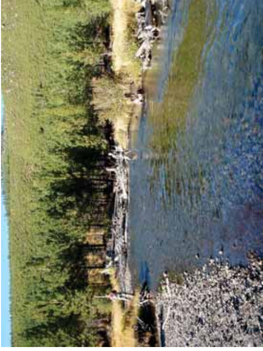
Figure 22. SR A1-RR: Transect 3 Riffle – From 40' upstream looking downstream.