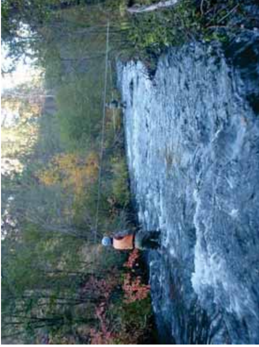
Figure 168. R B: Transect 7 Riffle – From 20’ downstream looking upstream.