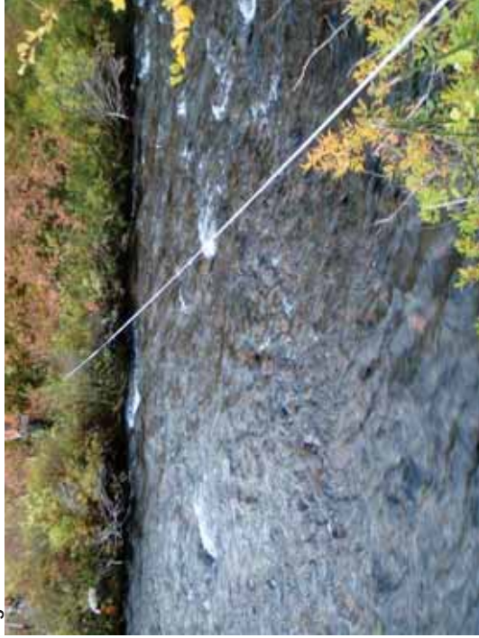
Figure 114. SR A2: Transect 3 Riffle – From left bank water's edge looking to right bank.