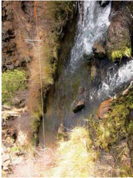
Figure 210. R B: Transect 1 Pool – From 15' upstream looking downstream.