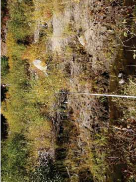
Figure 17. SR A1-RR: Transect 4 Side Channel – From left bank water's edge of side channel to right bank of side channel.