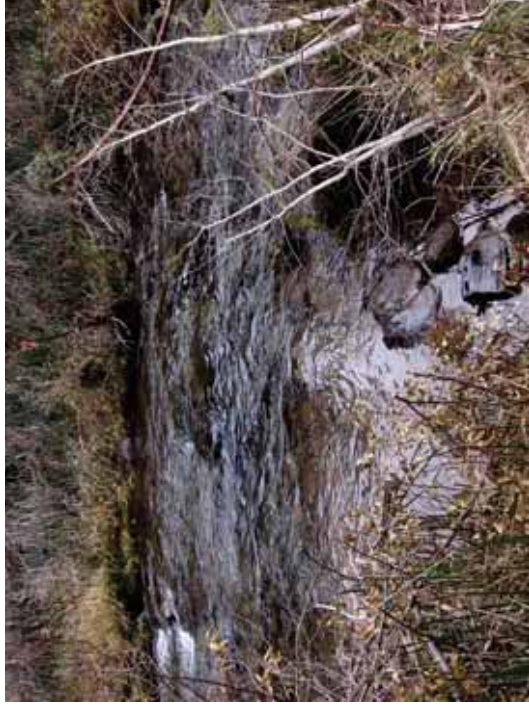
Figure 190. R B: Transect 8 Pool – From right bank water's edge looking to left bank.