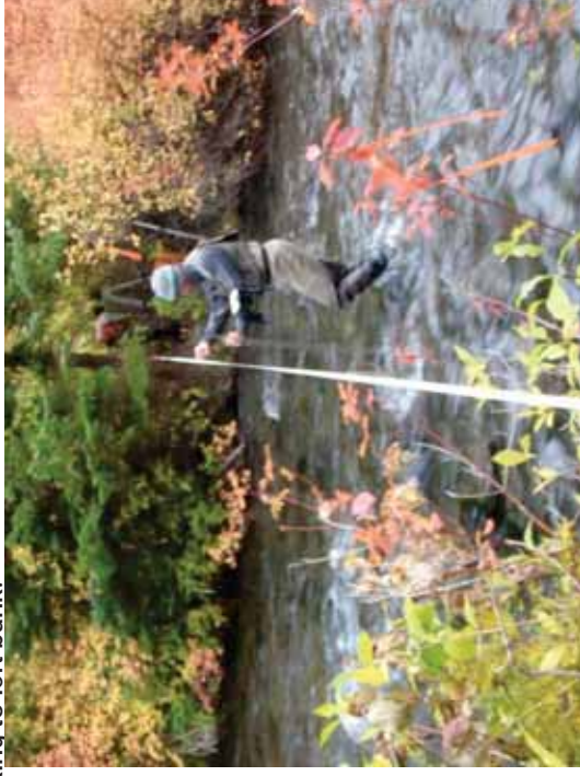
Figure 103. SR A1-RB: Transect 1 Riffle – From left bank looking to right bank.