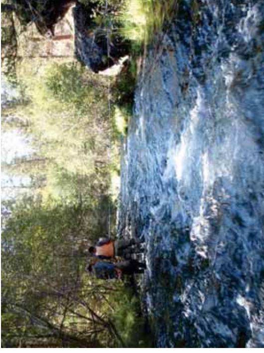
Figure 149. R B: Transect 5 Riffle – From 20' downstream looking upstream.