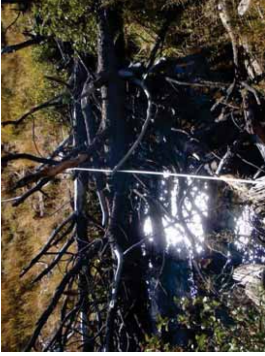
Figure 51. SR A1-RR: Transect 2 Side Channel – From right bank of side channel to left bank of side channel.