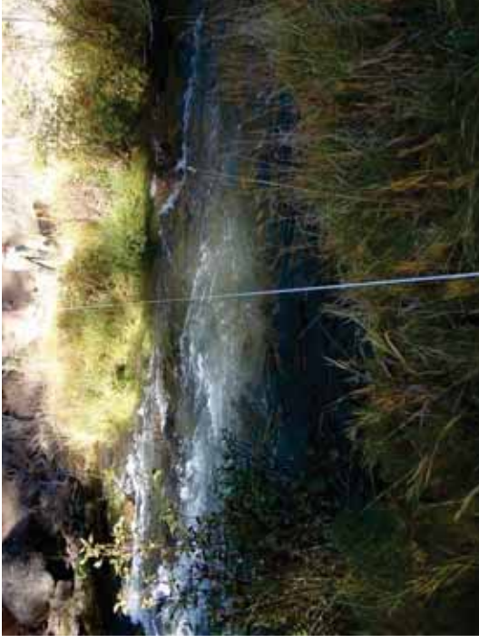
Figure 185. R B: Transect 1 Pool – From left bank looking to right bank.