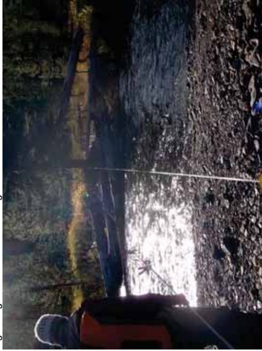
Figure 40. SR A1-RR: Transect 6 Riffle – From right bank tail pin looking to left bank.