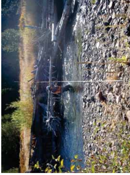
Figure 41. SR A1-RR: Transect 5 Pool – From right bank tail pin looking to left bank.