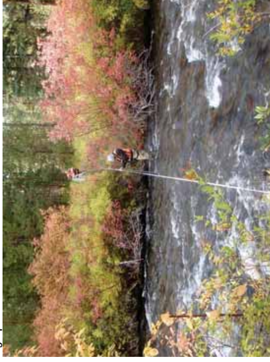
Figure 129. SR A2: Transect 4 Riffle – From left bank water's edge looking to right bank.