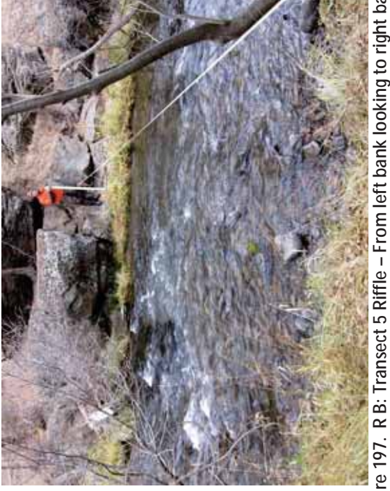
Figure 197. R B: Transect 5 Riffle – From left bank looking to right bank.