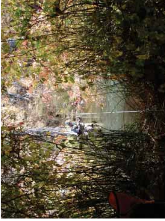
Figure 123. SR A2: Transect 6 Lateral Pool – From right bank looking to left bank.