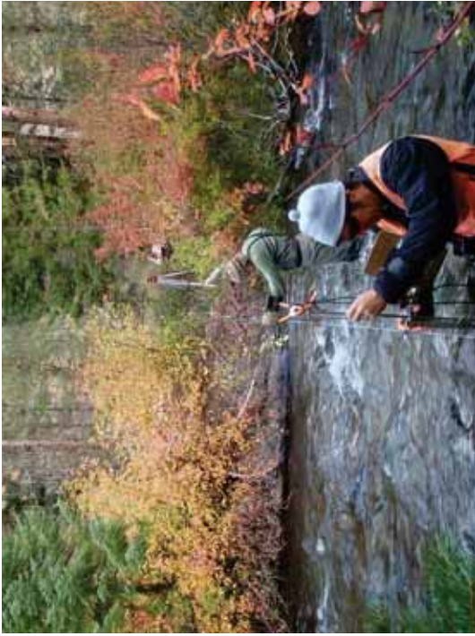
Figure 100. SR A1-RB: Transect 2 Riffle – From left bank water's edge looking to right bank.