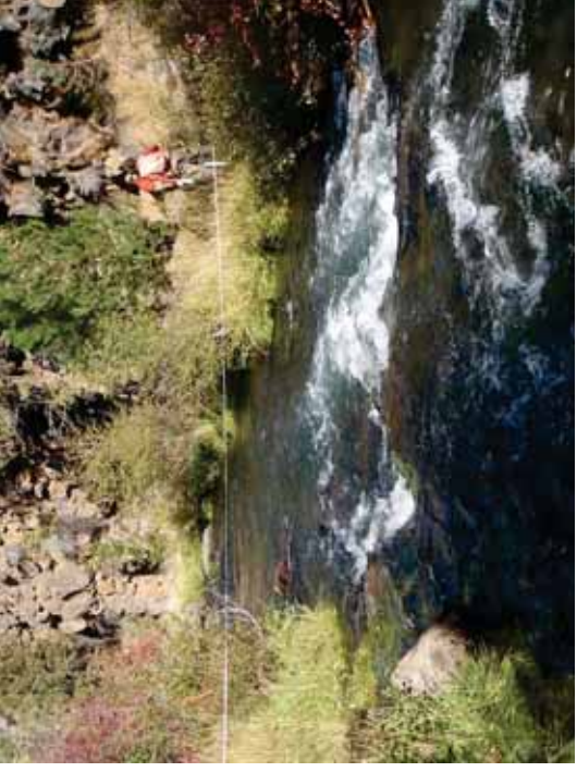
Figure 163. R B: Transect 1 Pool – From 20' upstream looking downstream.