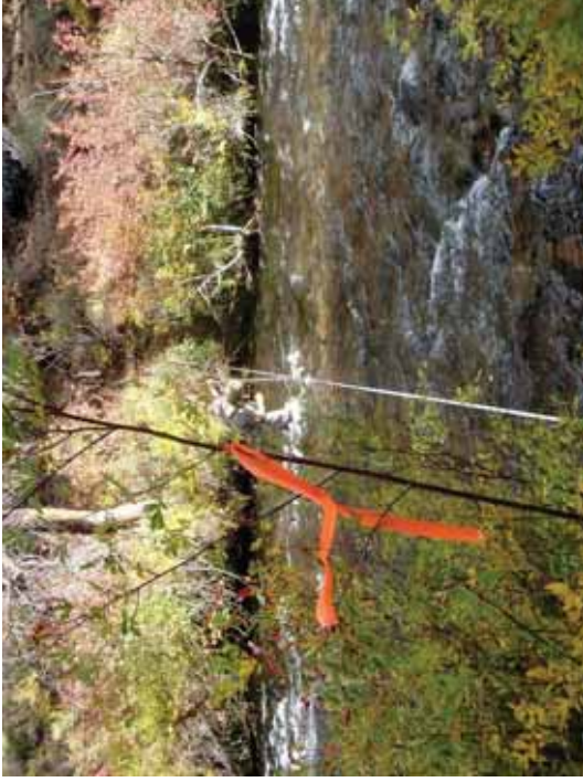
Figure 126. SR A2: Transect 5 Low Gradient Riffle – From right bank water's edge looking to left bank.