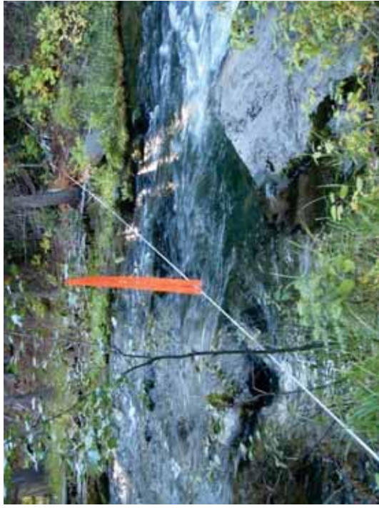
Figure 62. SR A1-RB: Transect 8 Pool – From right bank water's edge looking to left bank.