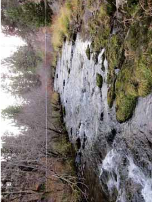
Figure 204. R B: Transect 3 Riffle – From 20' downstream looking upstream.