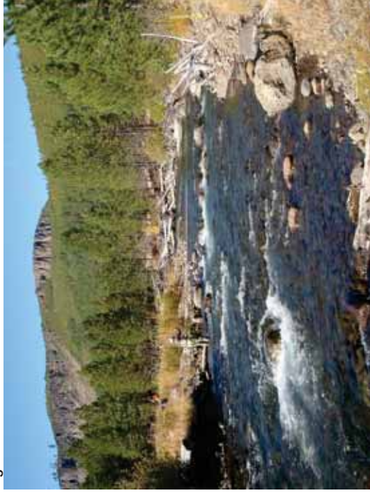
Figure 56. SR A1-RR: Transect 1 Riffle – From 30' downstream on right bank looking upstream.