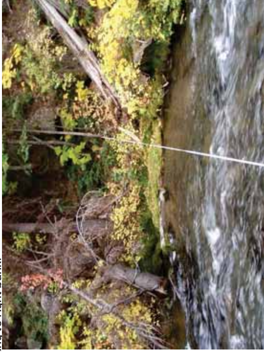
Figure 94. SR A1-RB: Transect 4 Rapid– From right bank water's edge looking to left bank.