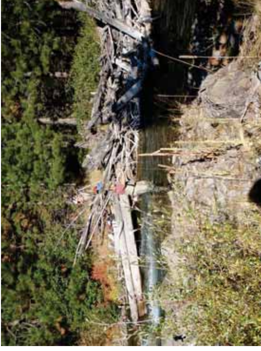
Figure 2. SR A1-RR: Transect 8 Pool – From left bank looking to right bank.