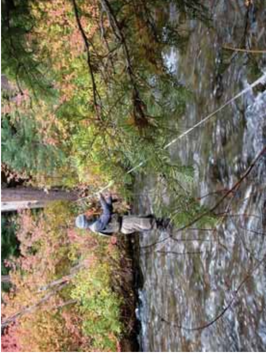
Figure 101. SR A1-RB: Transect 1 Riffle – From right bank water's edge looking to left bank.