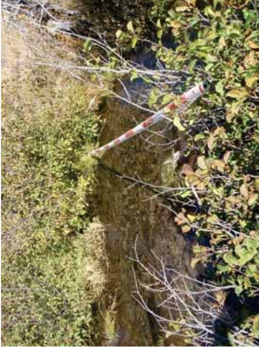
Figure 58. SR A1-RR: Transect 1 Side Channel – From left bank water's edge of side channel looking to right bank of side channel.