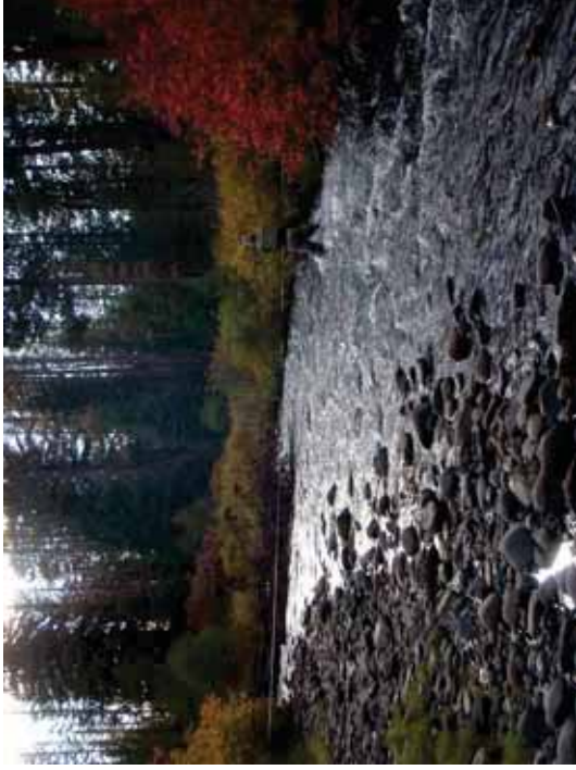
Figure 138. SR A2: Transect 1 Riffle – From 20' downstream looking upstream.