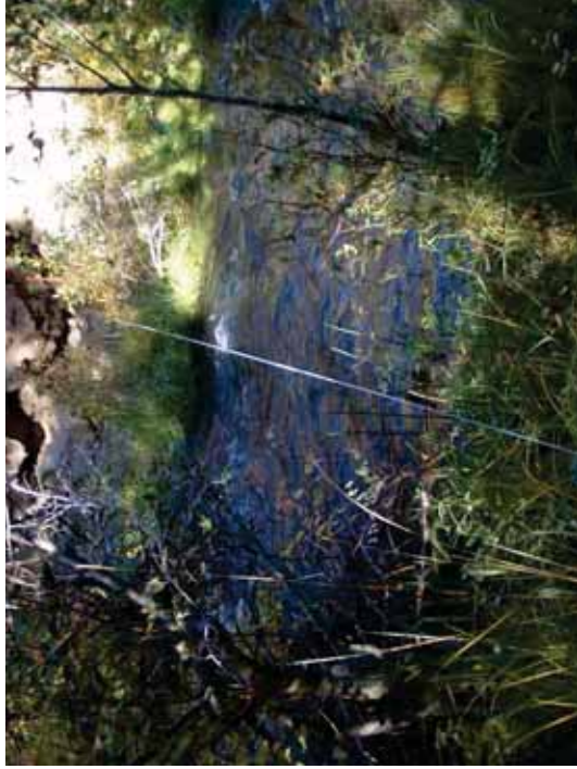
Figure 182. R B: Transect 2 Riffle – From left bank looking to right bank.