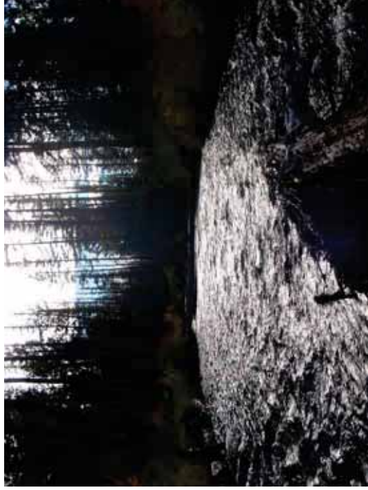
Figure 132. SR A2: Transect 3 Riffle – From 30' downstream looking upstream.