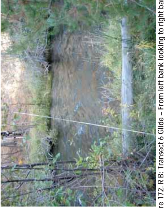
Figure 172. R B: Transect 6 Glide – From left bank looking to right bank.