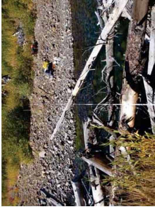
Figure 12. SR A1-RR: Transect 5 Pool – From left bank looking to right bank.