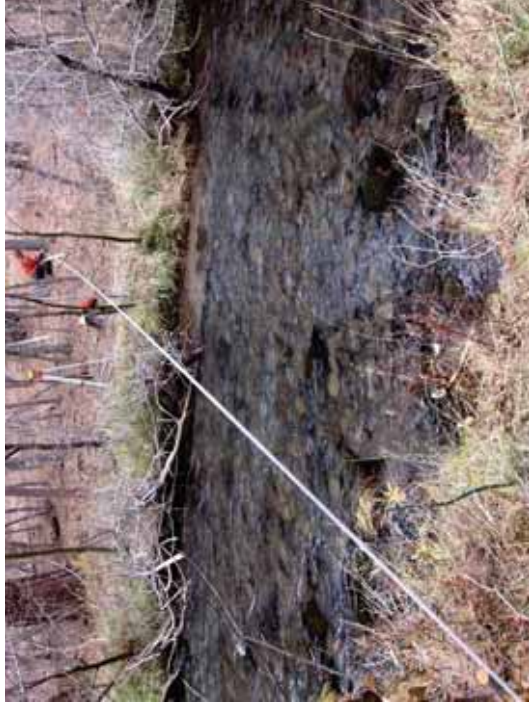
Figure 194. R B: Transect 6 Glide – From left bank looking to right bank.