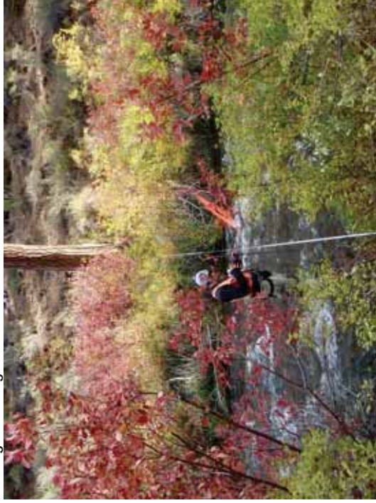
Figure 128. SR A2: Transect 4 Riffle – From right bank looking to left bank.