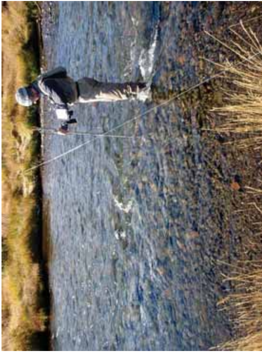
Figure 47. SR A1-RR: Transect 3 Riffle – From left bank water's edge looking to right bank.