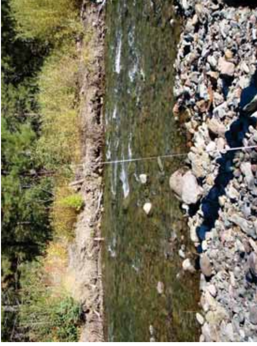
Figure 6. SR A1-RR: Transect 7 Riffle – From left bank looking to right bank.