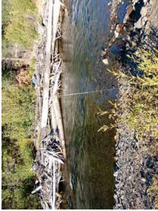
Figure 23. SR A1-RR: Transect 2 Pool – From near left bank water's edge looking to right bank.