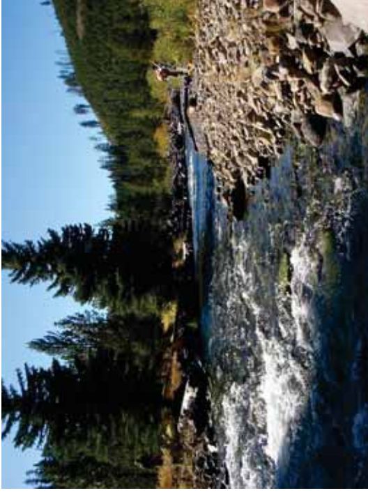
Figure 10. SR A1-RR: Transect 6 Riffle – From 30' downstream looking upstream.