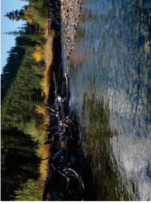
Figure 43. SR A1-RR: Transect 5 Pool – From 30' downstream looking upstream.