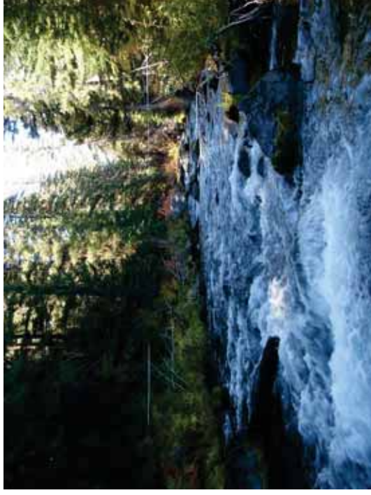
Figure 67. SR A1-RB: Transect 6 Riffle – From 30' downstream looking upstream.