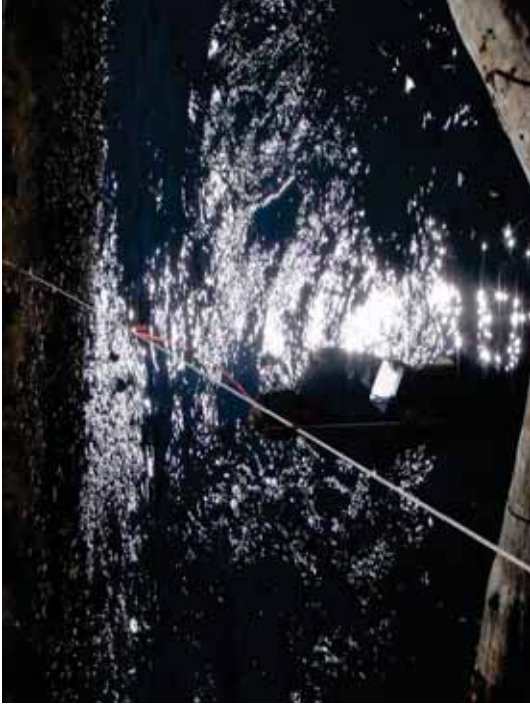
Figure 54. SR A1-RR: Transect 2 Pool – From right bank water's edge looking to left bank.