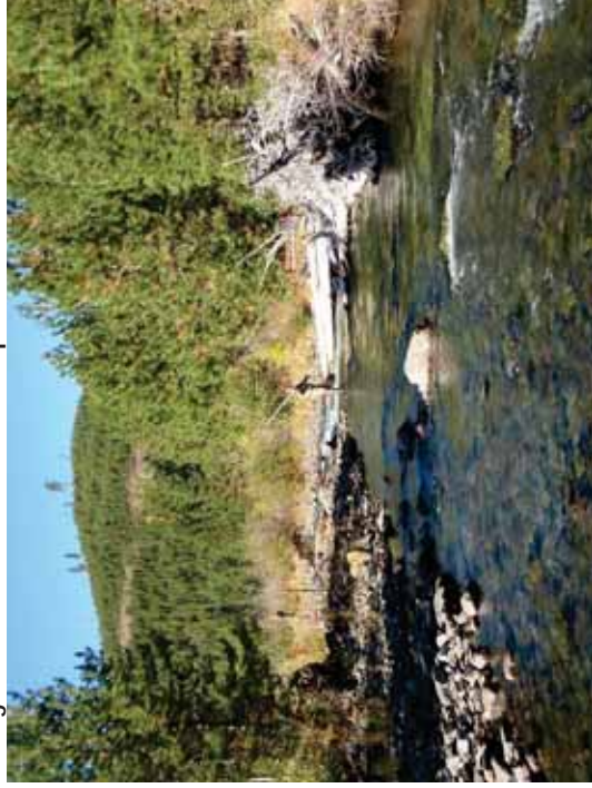
Figure 3. SR A1-RR: Transect 8 Pool – From 30' downstream looking upstream.