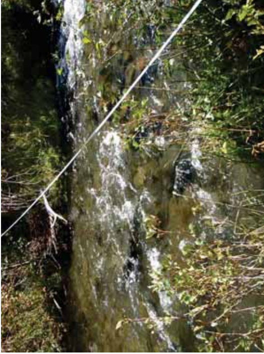
Figure 152. R B: Transect 4 Riffle – From right bank looking to left bank.