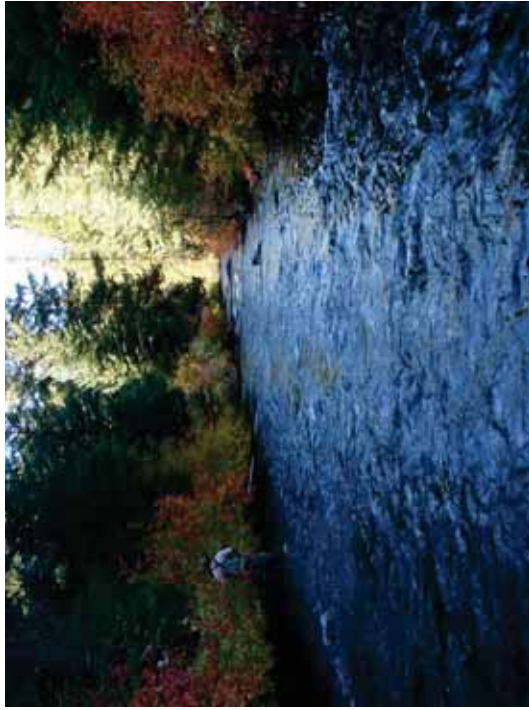
Figure 82. SR A1-RB; Transect 1 Riffle – From 30' downstream looking upstream.