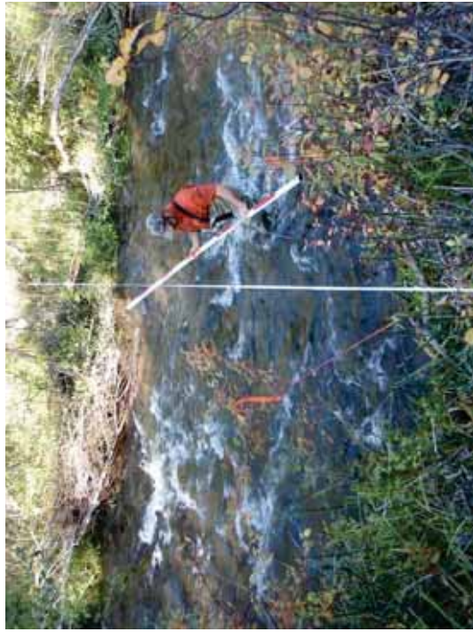
Figure 143. R B: Transect 7 Riffle – From left bank looking to right bank.