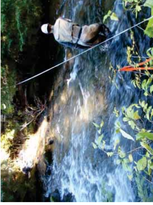
Figure 69. SR A1-RB: Transect 5 Rapid – From left bank looking to right bank.