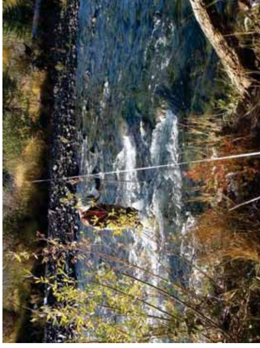
Figure 37. SR A1-RR: Transect 7 Riffle – From right bank looking to left bank.