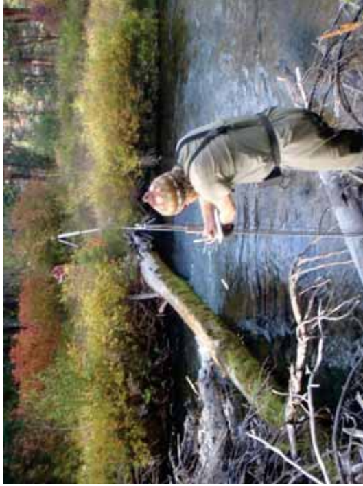
Figure 136. SR A2: Transect 2 Pool – From left bank water's edge looking to right bank.