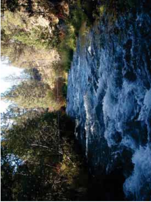
Figure 180. R B: Transect 3 Riffle – From 30' downstream looking upstream.