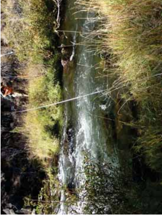
Figure 161. R B: Transect 1 Pool – From left bank looking to right bank.