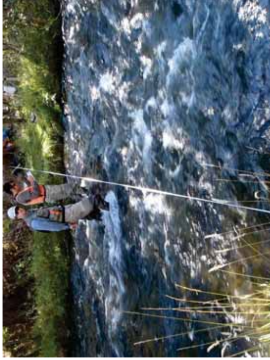
Figure 150. R B: Transect 5 Riffle – From right bank water's edge looking to left bank.