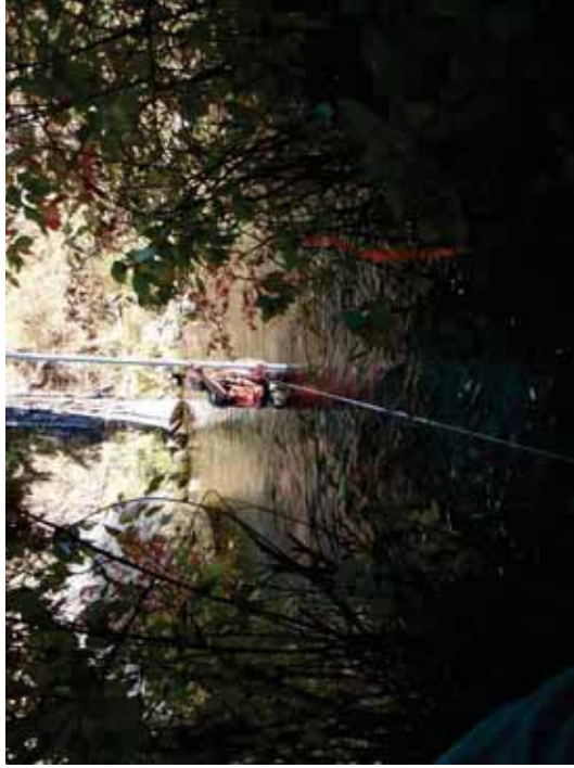
Figure 106. SR A2: Transect 6 Lateral Pool – From right bank water's edge looking to left bank.