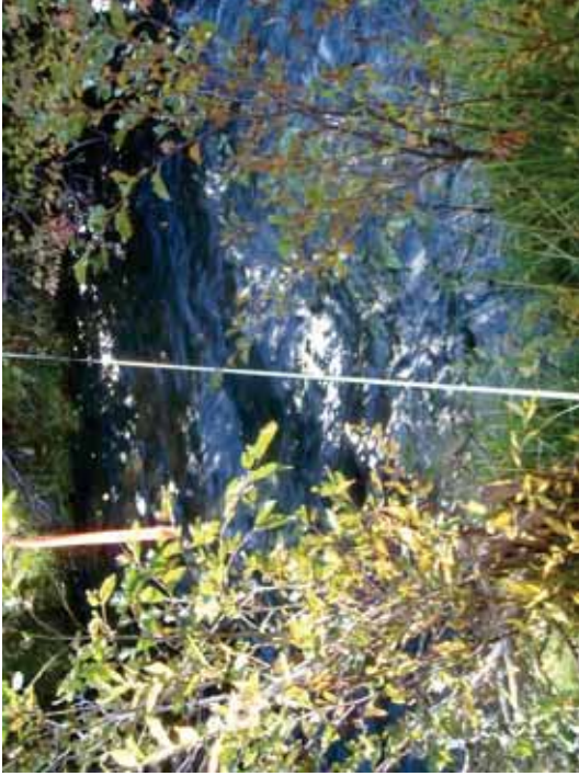
Figure 184. R B: Transect 2 Riffle – From right bank looking to left bank.