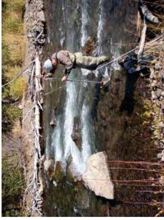
Figure 57. SR A1-RR: Transect 1 Riffle – From left bank water's edge looking to right bank.