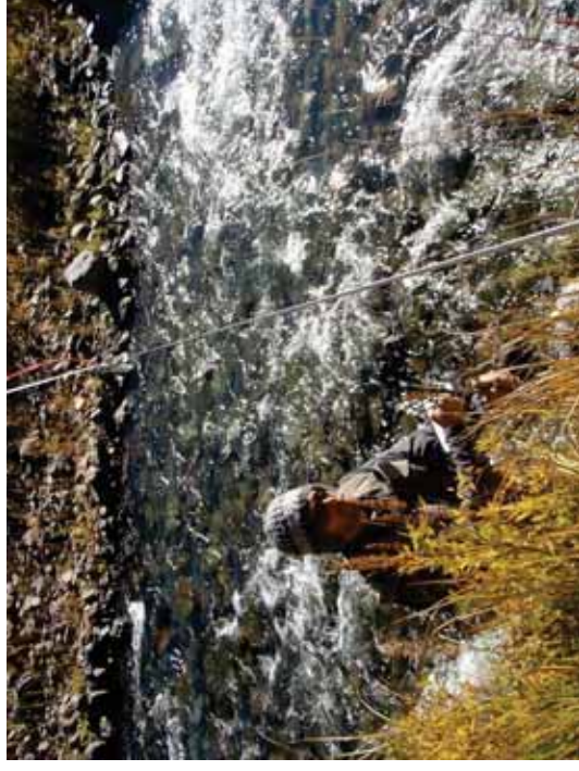
Figure 45. SR A1-RR: Transect 4 Riffle – From right bank water's edge looking to left bank water's edge.