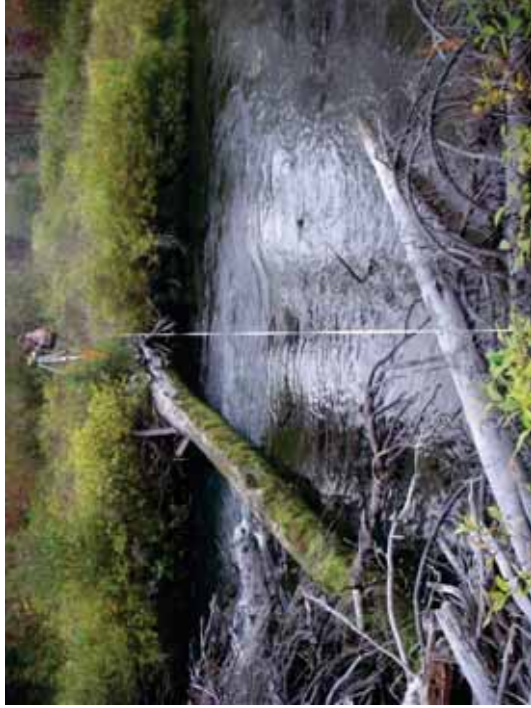
Figure 118. SR A2: Transect 2 Pool – From left bank looking to right bank.