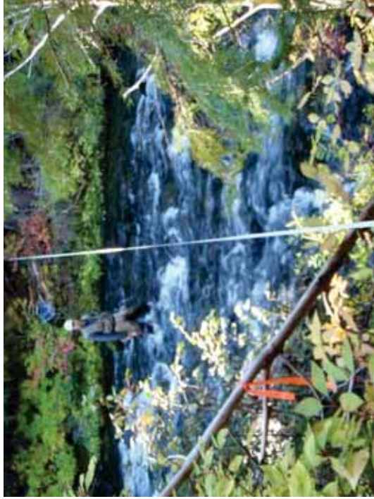
Figure 66. SR A1-RB: Transect 6 Riffle – From right bank looking to left bank.