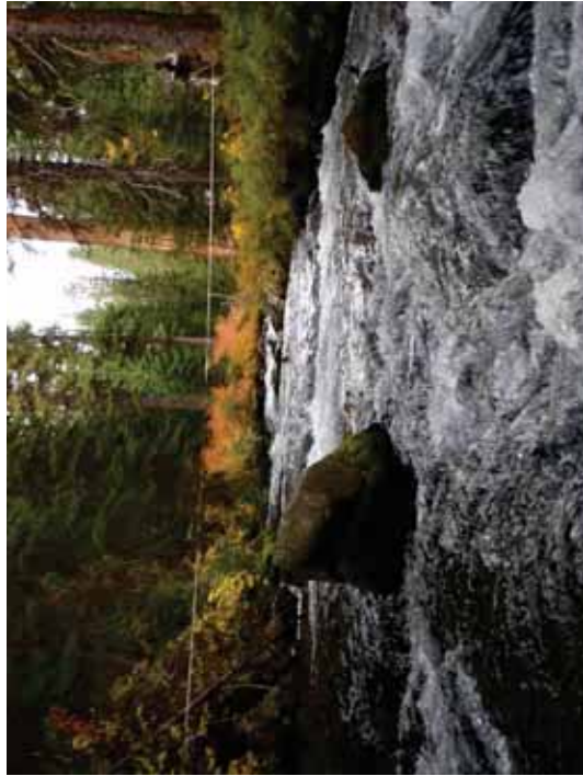
Figure 96. SR A1-RB: Transect 3 Plunge Pool – From 25' downstream looking upstream.