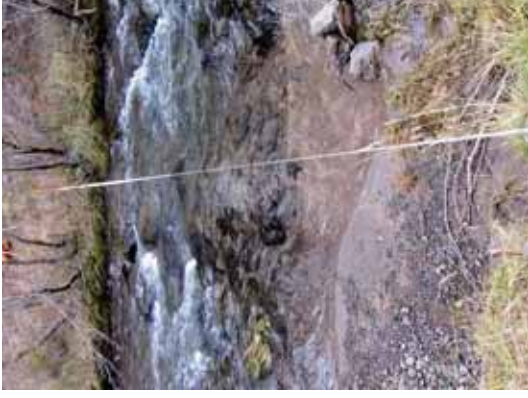
Figure 205. R B: Transect 3 Riffle – From right bank water's edge looking to left bank.