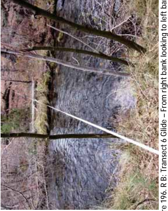
Figure 196. R B: Transect 6 Glide – From right bank looking to left bank.