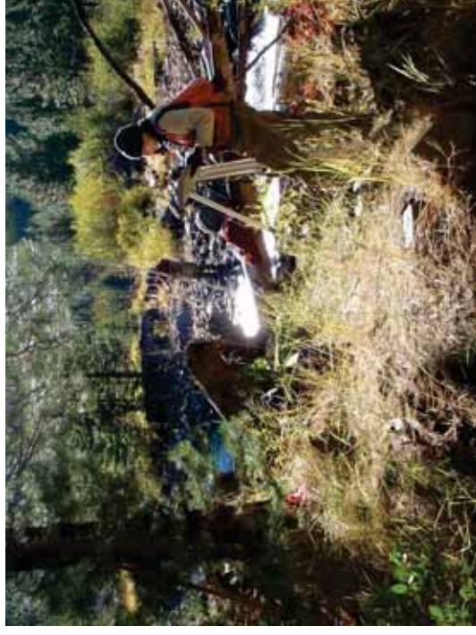
Figure 4. SR A1-RR: Transect 8 Pool – From right bank tail pin looking to left bank.