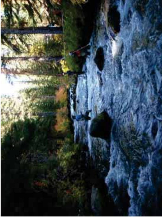
Figure 76. SR A1-RB: Transect 3 Plunge Pool – From 30' downstream looking upstream.