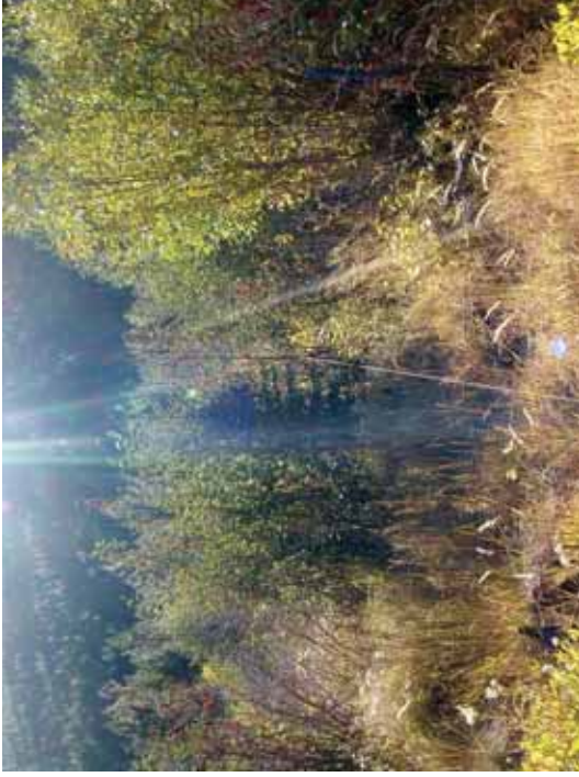
Figure 1. SR A1-RR: Transect 8 Dewatered Habitat – From left bank head pin looking back to habitat behind headpin.