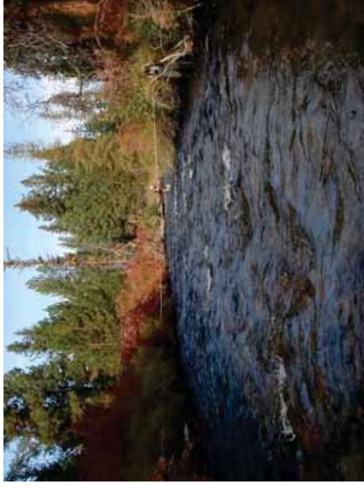
Figure 125. SR A2: Transect 5 Low Gradient Riffle – From 30' upstream looking downstream.