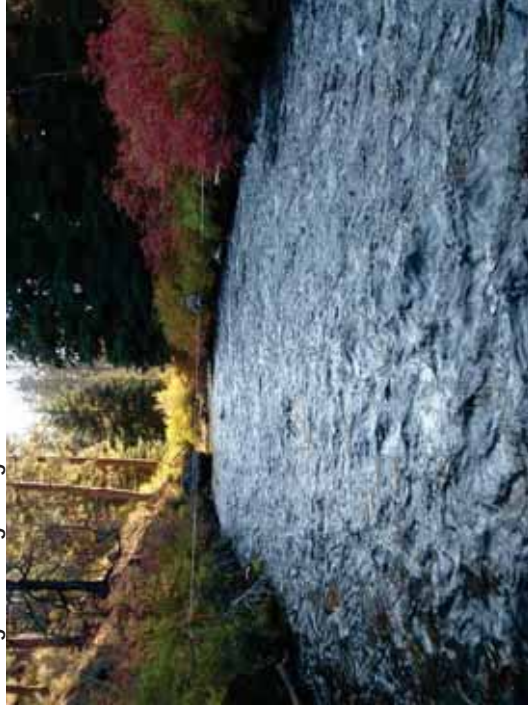
Figure 110. SR A2: Transect 4 Riffle – From 30' downstream looking upstream.