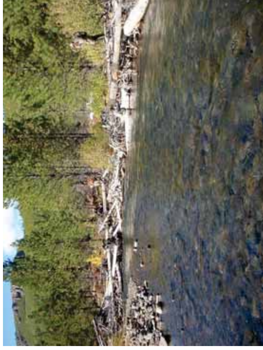
Figure 53. SR A1-RR: Transect 2 Pool – From 30' downstream looking upstream.