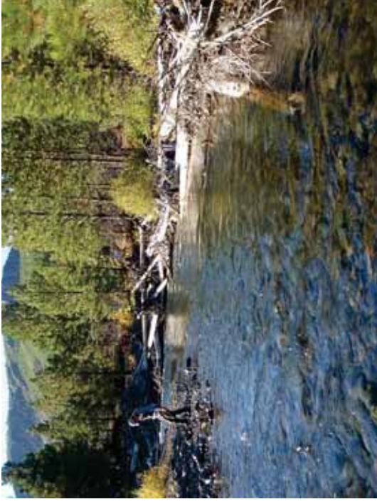
Figure 26. SR A1-RR: Transect 2 Pool – From 25' downstream looking upstream.