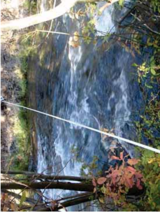
Figure 181. R B: Transect 3 Riffle – From left bank looking to right bank.