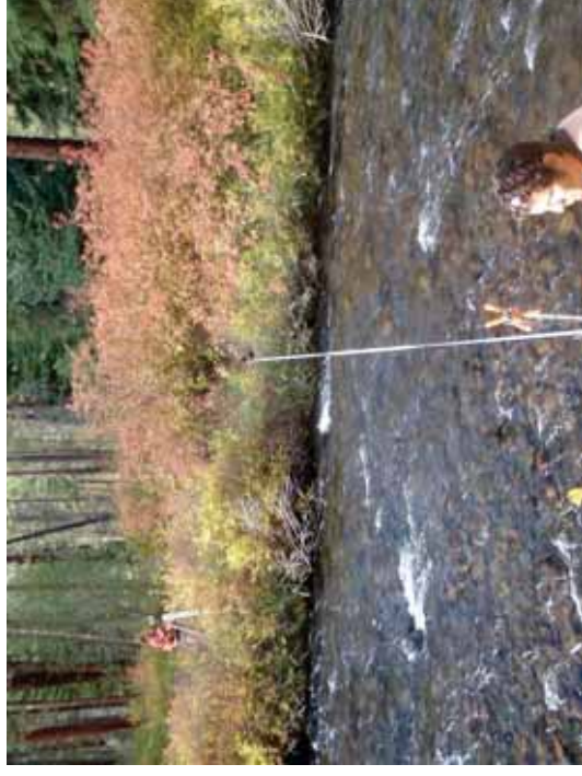
Figure 133. SR A2: Transect 3 Riffle – From left bank water's edge to right bank.