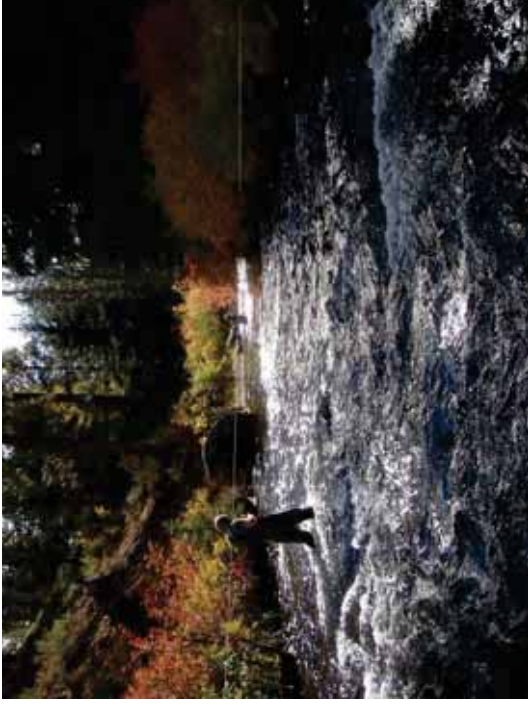
Figure 127. SR A2: Transect 5 Low Gradient Riffle – From 15' downstream looking upstream.