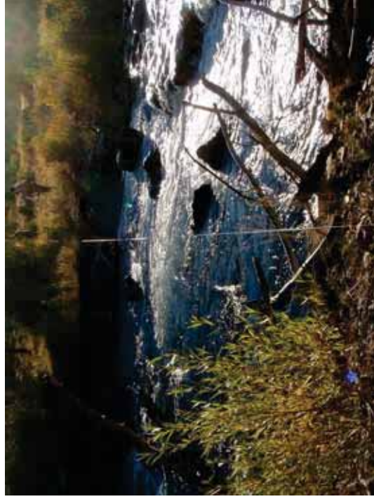
Figure 29. SR A1-RR: Transect 1 Riffle – From right bank tail pin looking to left bank.