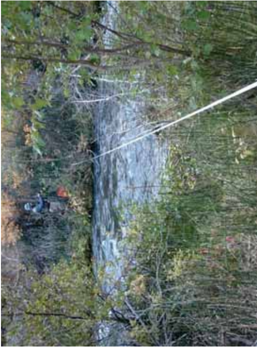
Figure 164. R B: Transect 8 Pool – From right bank looking to left bank.