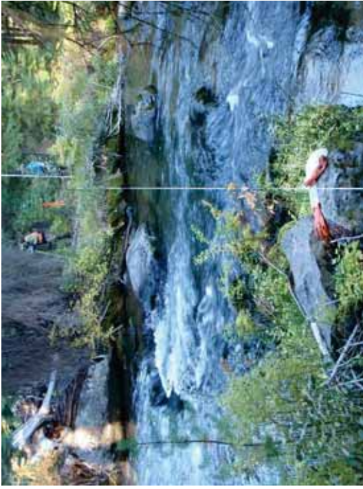
Figure 60. SR A1-RB: Transect 8 Pool – From left bank looking to right bank.