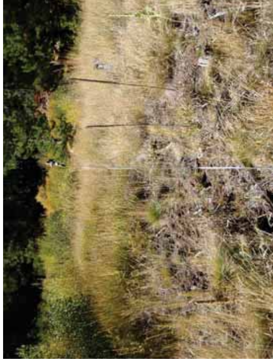
Figure 16. SR A1-RR: Transect 4 Dewatered Habitat – From left bank head pin looking toward right bank.