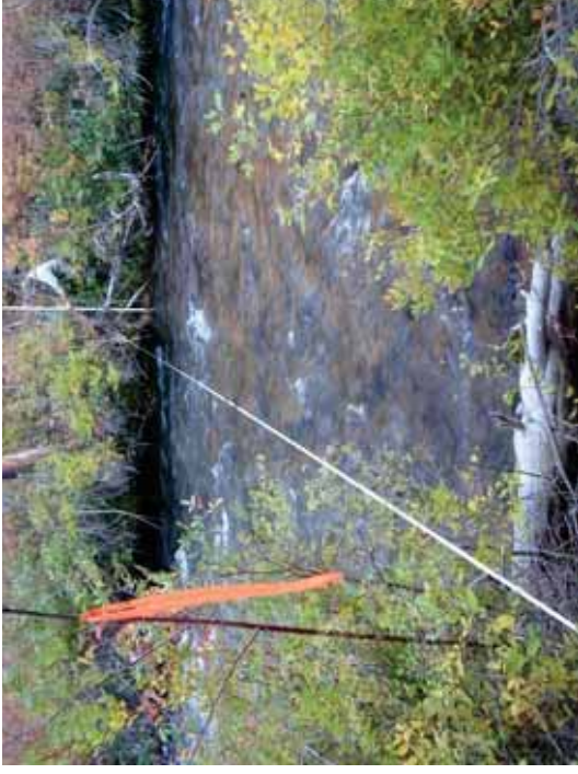
Figure 109. SR A2: Transect 5 Low Gradient Riffle – From right bank water's edge looking to left bank.