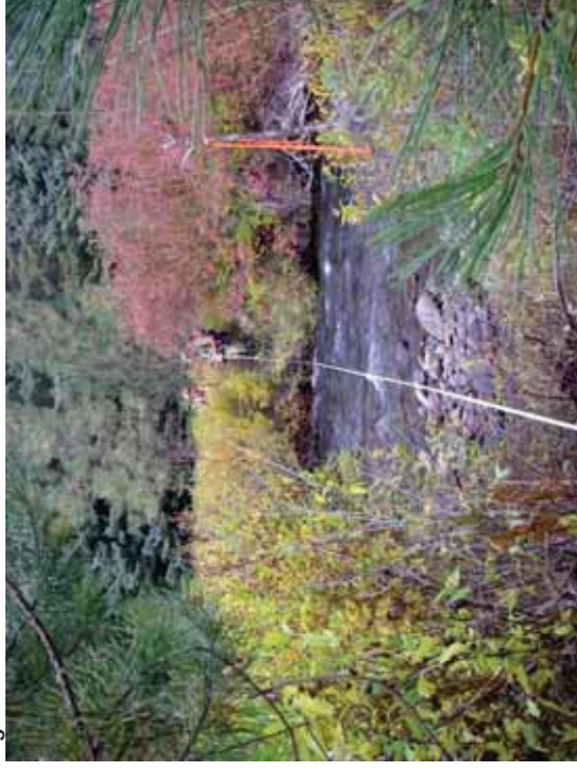
Figure 119. SR A2: Transect 1 Riffle – From left bank looking to right bank.