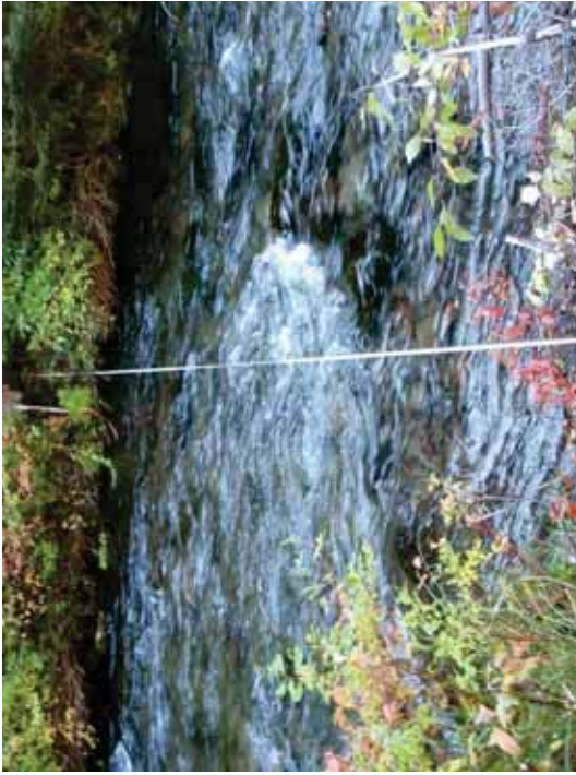
Figure 80. SR A1-RB; Transect 2 Riffle – From right bank looking to left bank.