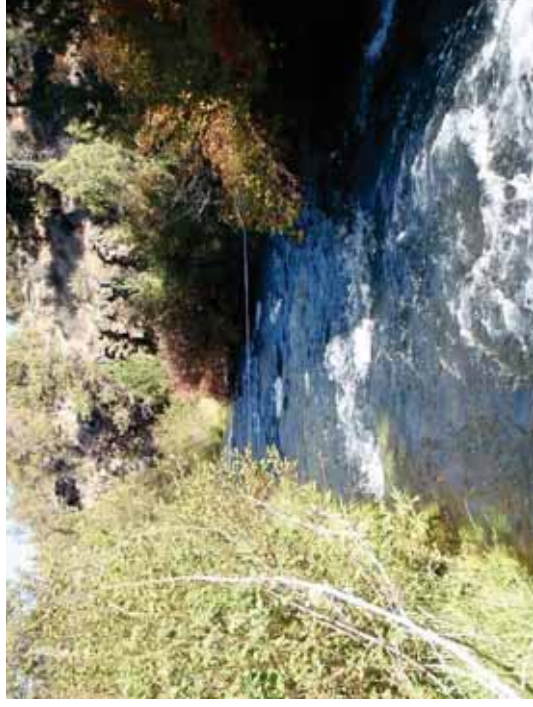
Figure 159. R B: Transect 2 Riffle – From 30' upstream looking downstream.