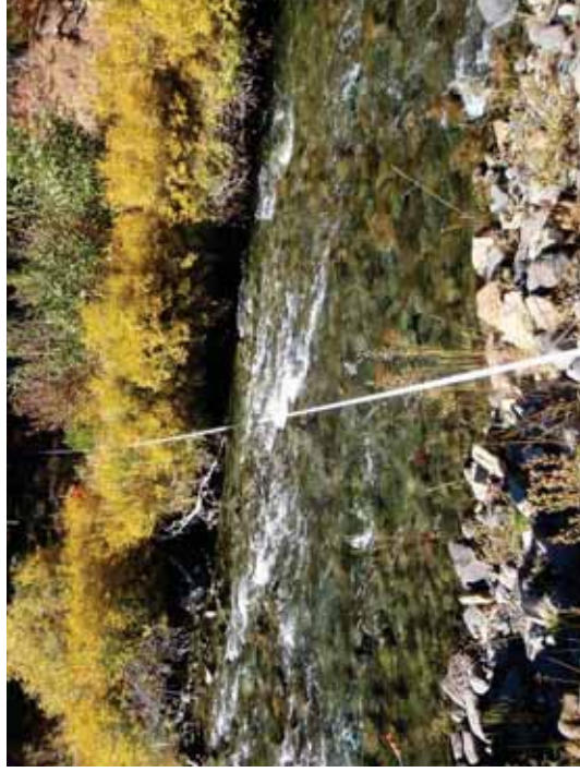
Figure 15. SR A1-RR: Transect 4 Riffle – From left bank near water’s edge looking to right bank.