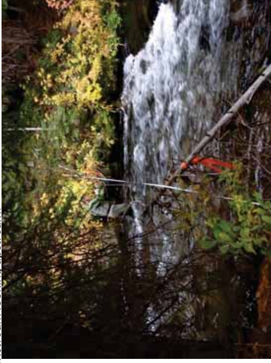
Figure 91. SR A1-RB: Transect 5 Rapid – From right bank looking to left bank.