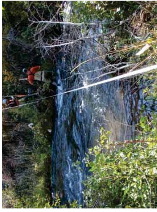
Figure 141. R B: Transect 8 Pool – From right bank looking to left bank.