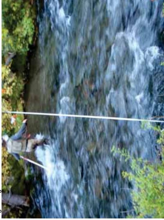
Figure 74. SR A1-RB: Transect 4 Rapid – From right bank water's edge looking to left bank.