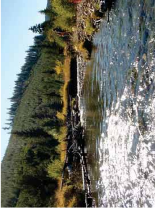
Figure 13. SR A1-RR: Transect 5 Pool – From 40’ downstream looking upstream.