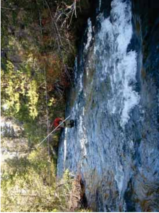
Figure 144. R B: Transect 7 Riffle – From 30' upstream looking downstream.