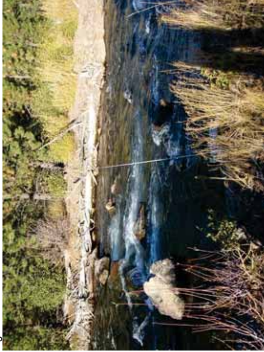
Figure 27. SR A1-RR: Transect 1 Riffle – From left bank head pin looking to right bank.