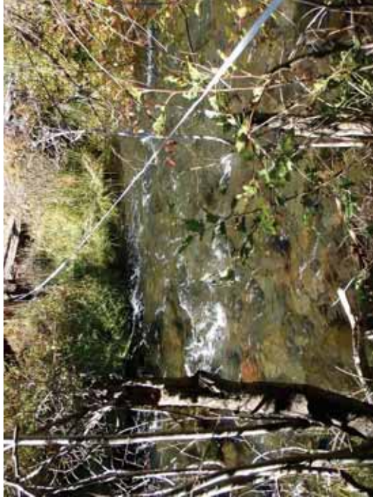
Figure 154. R B: Transect 4 Riffle – From left bank water's edge looking to right bank.