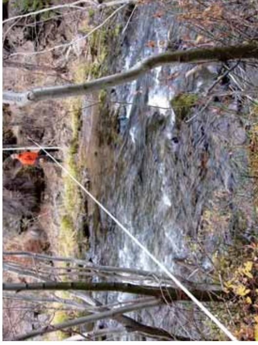
Figure 203. R B: Transect 3 Riffle – From left bank water's edge looking to right bank.