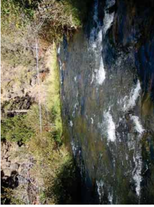
Figure 153. R B: Transect 4 Riffle – From 20' upstream looking downstream.