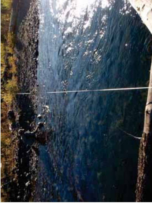
Figure 25. SR A1-RR: Transect 2 Pool – From right bank water's edge looking to left bank.