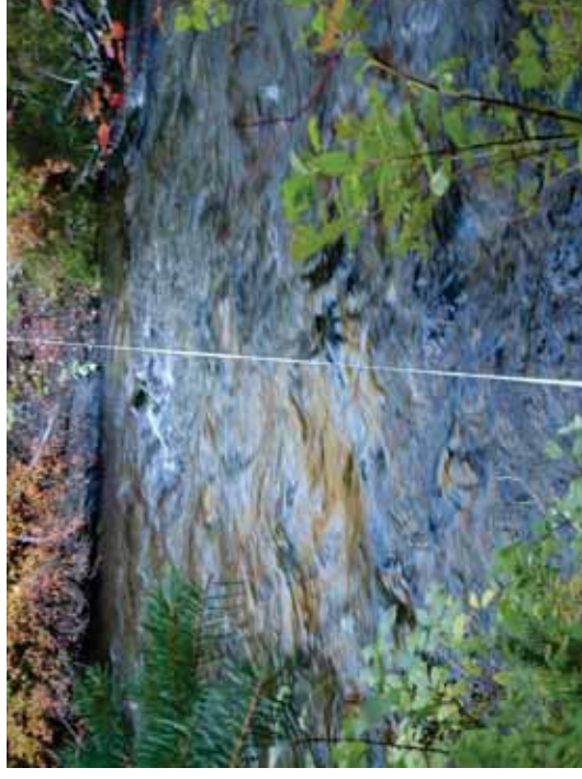
Figure 79. SR A1-RB: Transect 2 Riffle – From left bank water's edge looking to right bank.