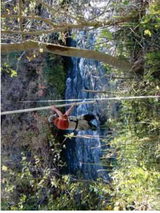
Figure 145. R B: Transect 7 Riffle – From right bank looking to left bank.