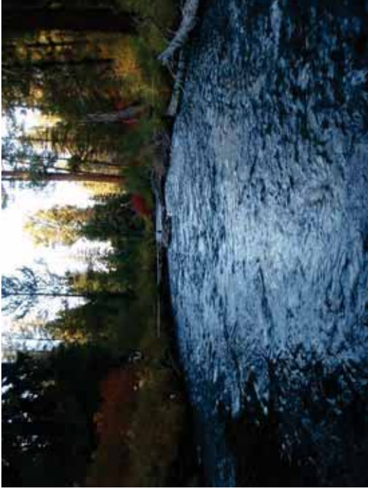
Figure 113. SR A2: Transect 3 Riffle – From 30' upstream looking downstream.