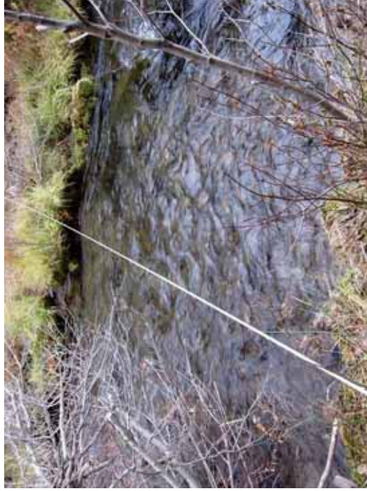
Figure 206. R B: Transect 2 Riffle – From left bank looking to right bank.