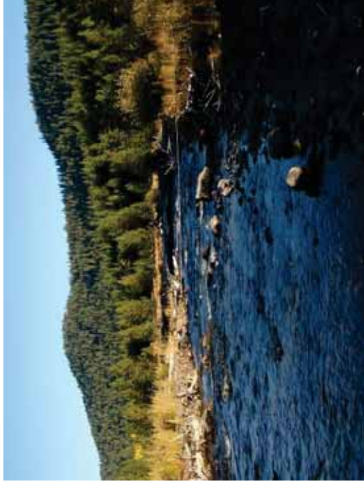
Figure 28. SR A1-RR: Transect 1 Riffle – From 30' upstream looking downstream.