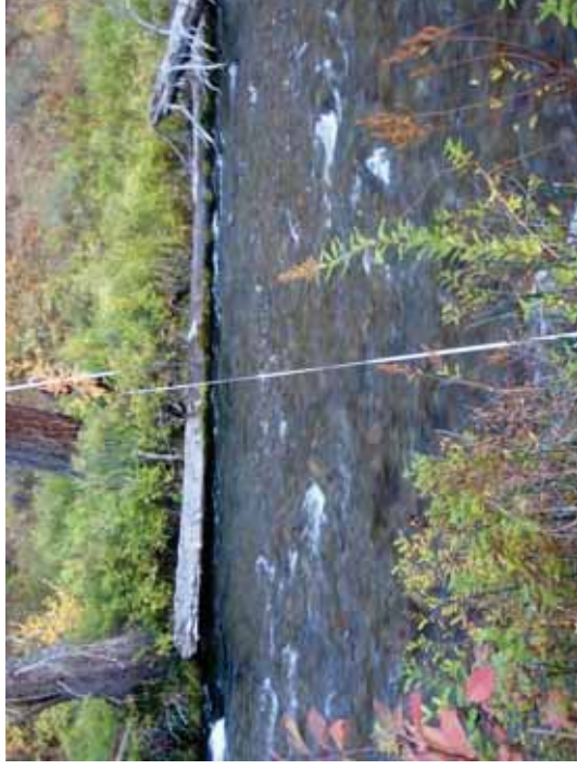
Figure 115. SR A2: Transect 3 Riffle – From right bank water's edge to left bank.