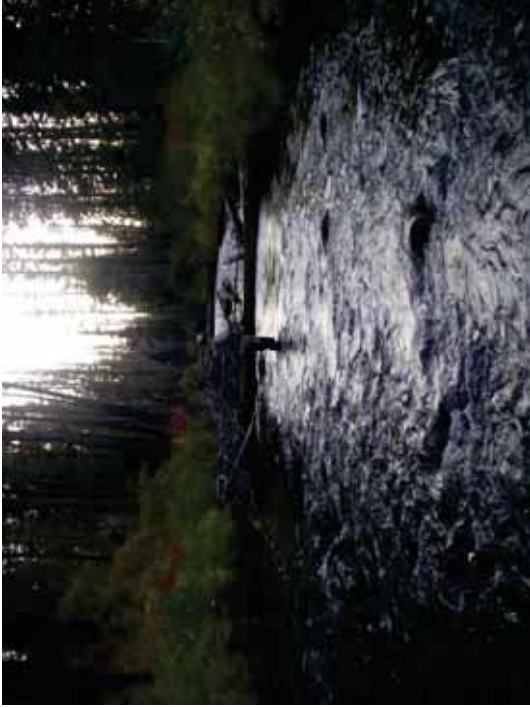
Figure 116. SR A2: Transect 2 Pool – From 30' downstream looking upstream.