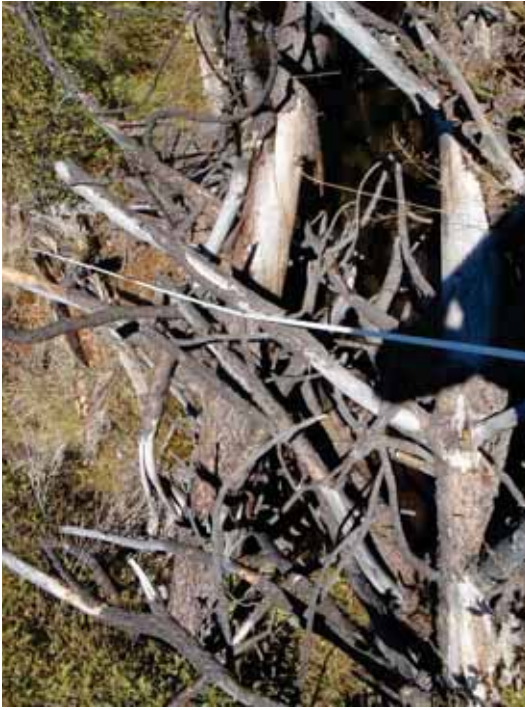
Figure 50. SR A1-RR: Transect 2 Side Channel – From left bank water's edge of side channel to right bank of side channel.