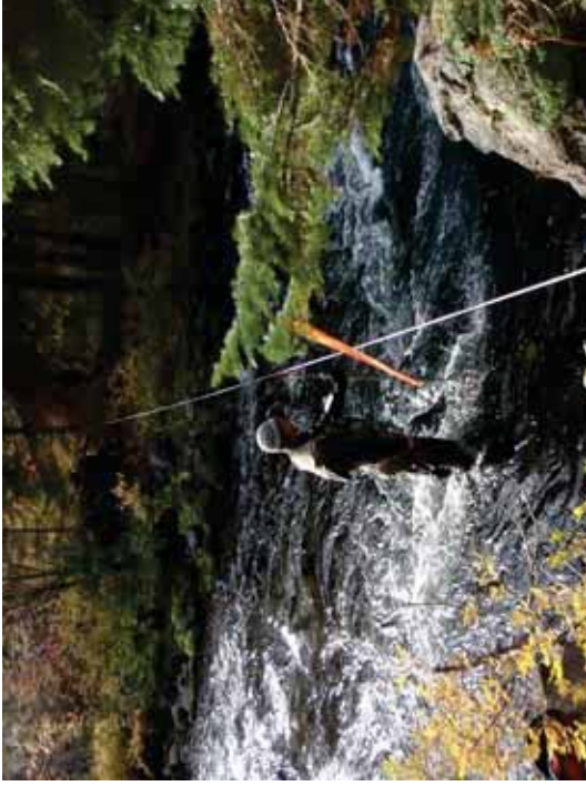
Figure 84. SR A1-RB: Transect 7 Pool – From right bank looking to left bank.