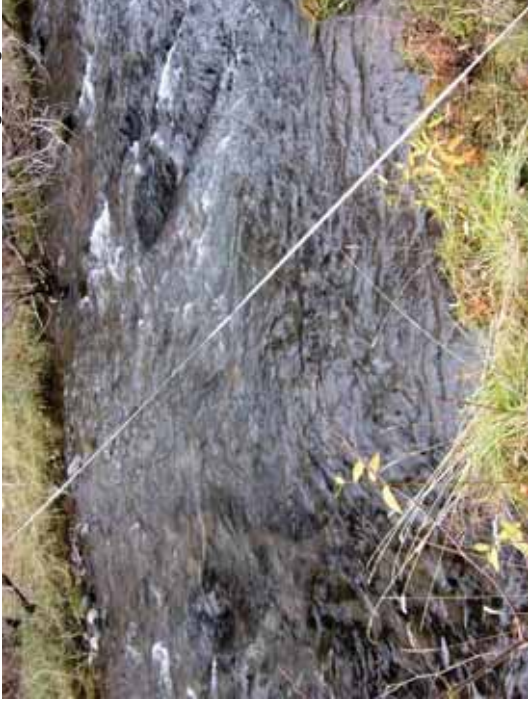
Figure 199. R B: Transect 5 Riffle – From right bank water's edge looking to left bank water's edge.