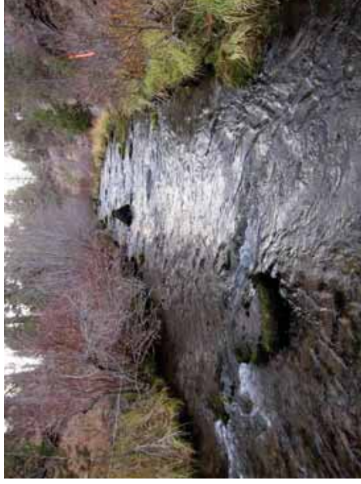
Figure 207. R B: Transect 2 Riffle – From 15' downstream looking upstream.