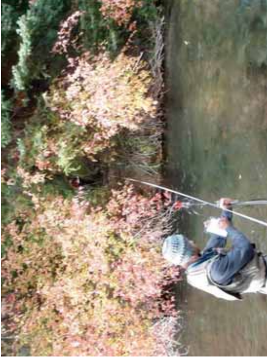
Figure 122. SR A2: Transect 6 Lateral Pool – From left bank water's edge looking to right bank.