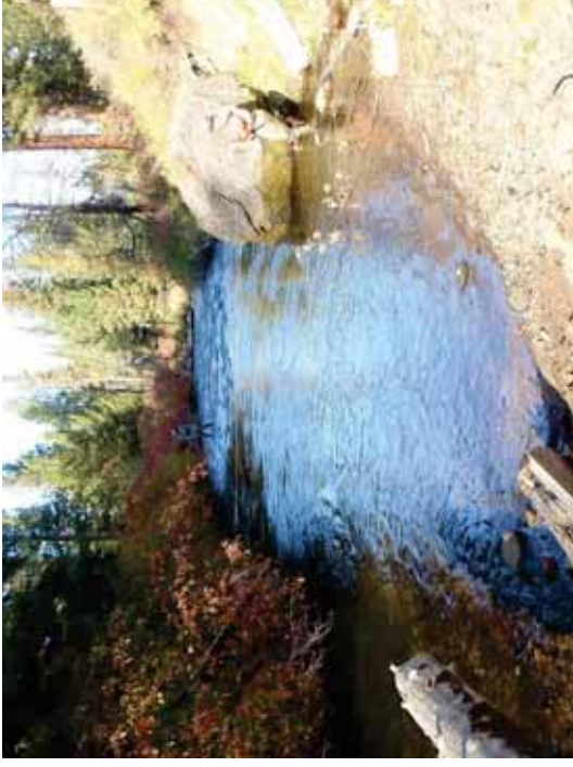
Figure 105. SR A2: Transect 6 Lateral Pool – From 20' upstream looking downstream.