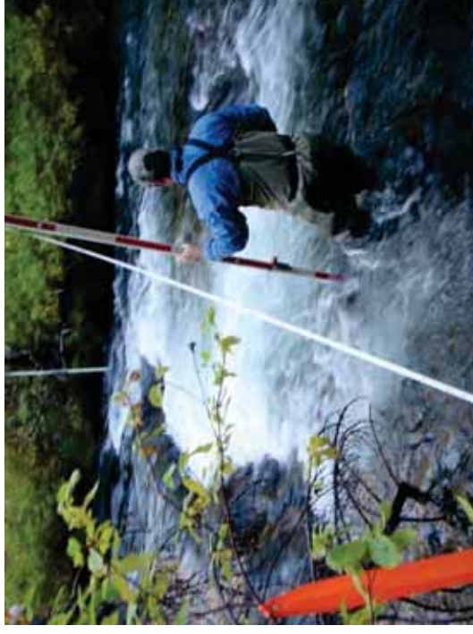
Figure 75. SR A1-RB: Transect 3 Plunge Pool – From left bank water's edge looking to right bank.