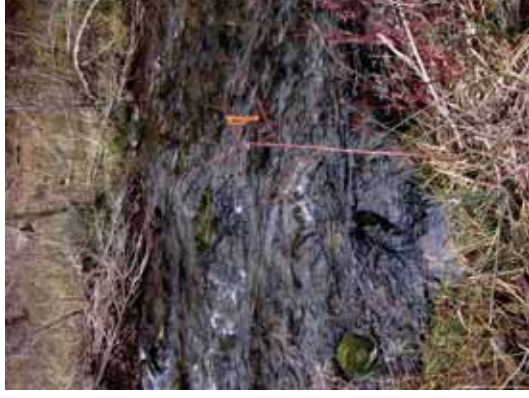
Figure 191. R B: Transect 7 Riffle – From left bank looking to right edge.