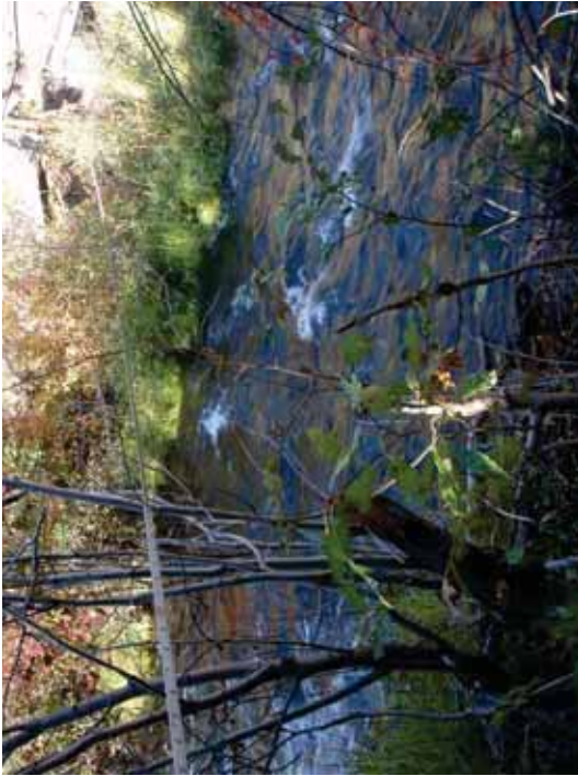
Figure 176. R B: Transect 4 Riffle – From left bank looking to right bank.