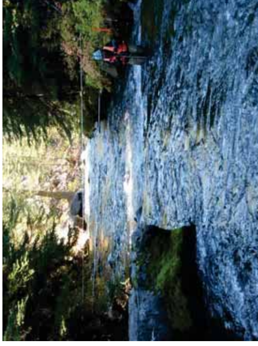
Figure 71. SR A1-RB: Transect 5 Rapid – From 20' upstream looking downstream.