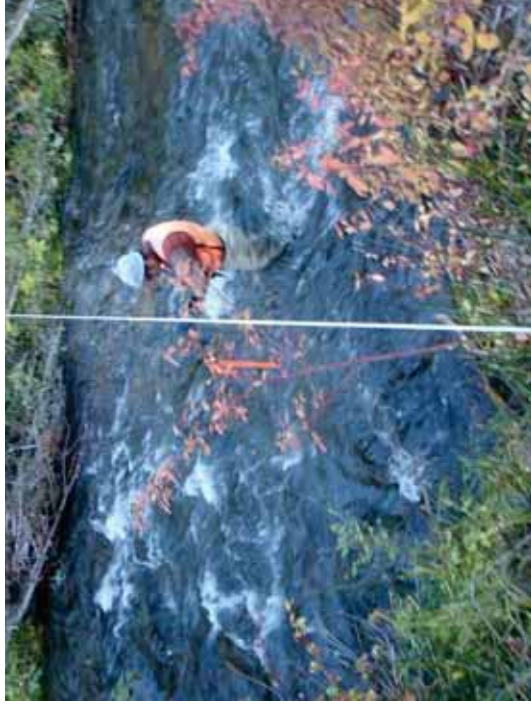
Figure 167. R B: Transect 7 Riffle – From left bank looking to right bank water's edge.