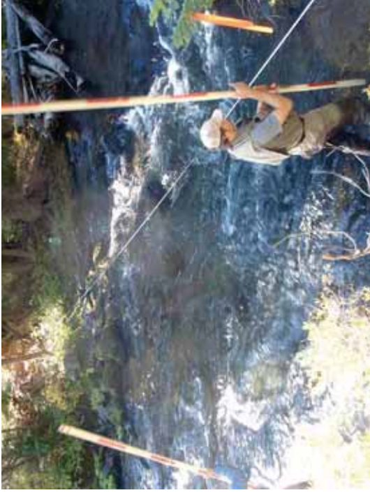
Figure 65. SR A1-RB: Transect 7 Pool – From right bank looking to left bank.