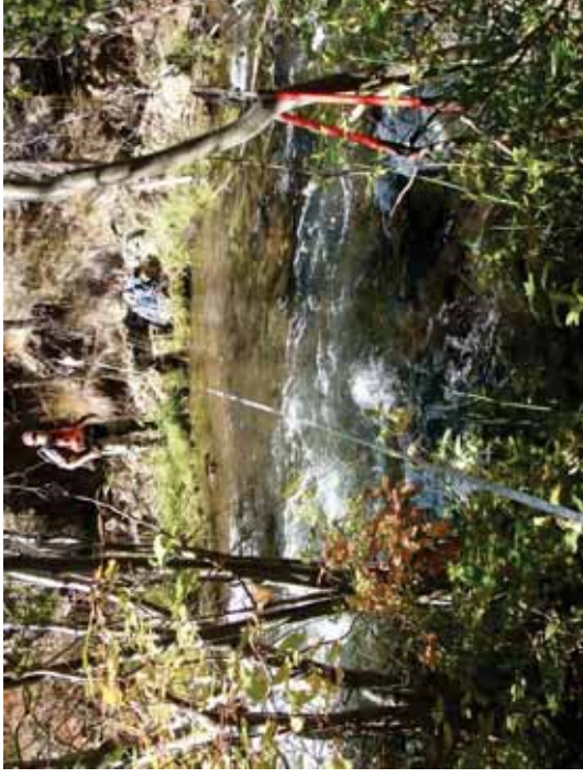
Figure 157. R B: Transect 3 Riffle – From left bank looking to right bank.