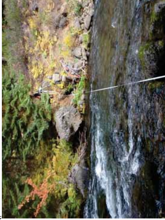
Figure 86. SR A1-RB: Transect 7 Pool – From left bank water's edge looking to right bank.