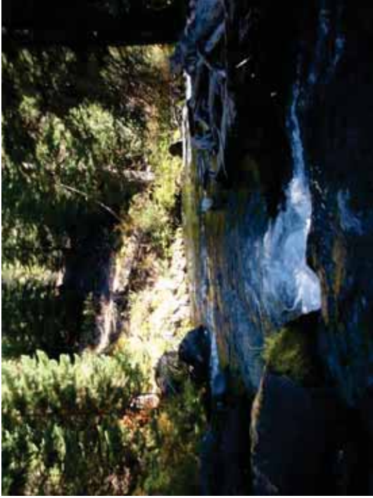
Figure 64. SR A1-RB: Transect 7 Pool – From 30' upstream looking downstream.