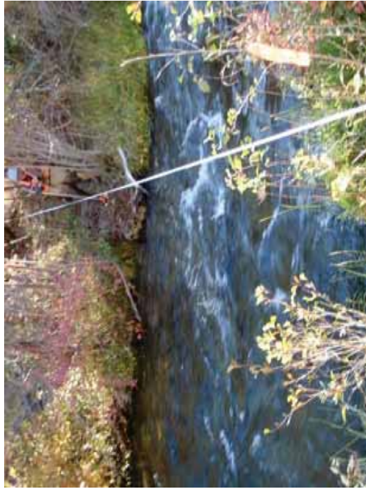
Figure 178. R B: Transect 4 Riffle – From right bank looking to left bank.