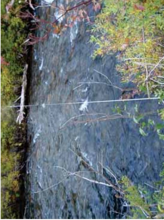
Figure 108. SR A2: Transect 5 Low Gradient Riffle – From left bank water's edge looking to right bank.