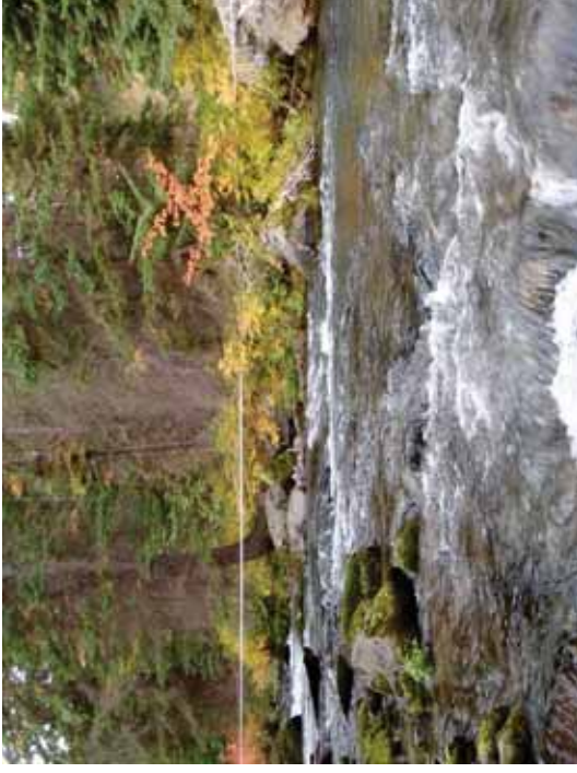
Figure 85. SR A1-RB: Transect 7 Pool – From 20' downstream looking upstream.