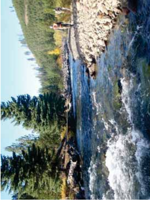
Figure 39. SR A1-RR: Transect 6 Riffle – From 30' downstream looking upstream.