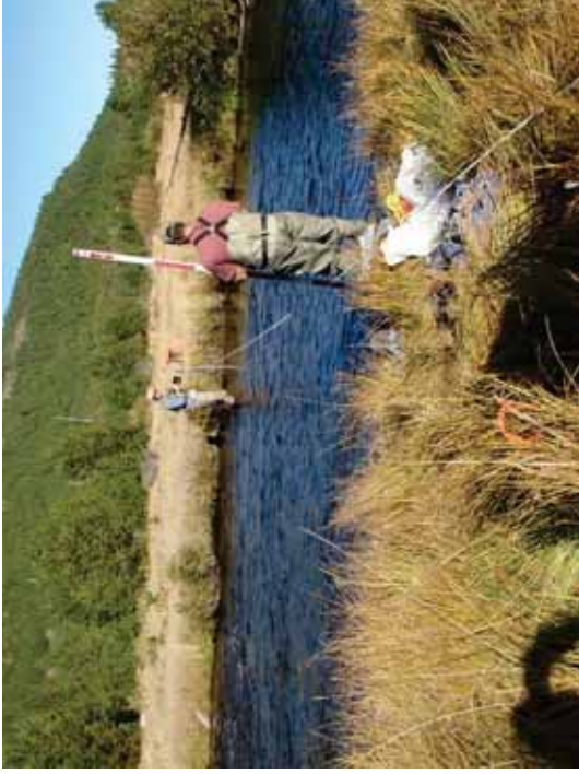
Figure 21. SR A1-RR: Transect 3 Riffle – From right bank tail pin looking to left bank.