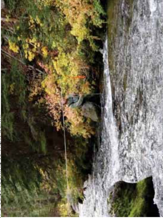
Figure 90. SR A1-RB: Transect 5 Rapid – From 20' upstream on right bank looking downstream.