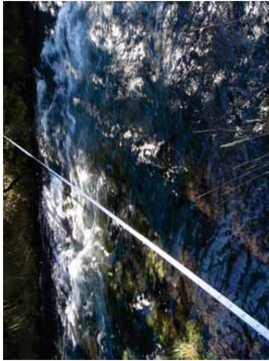
Figure 179. R B: Transect 3 Riffle – From right bank water's edge looking to left bank.