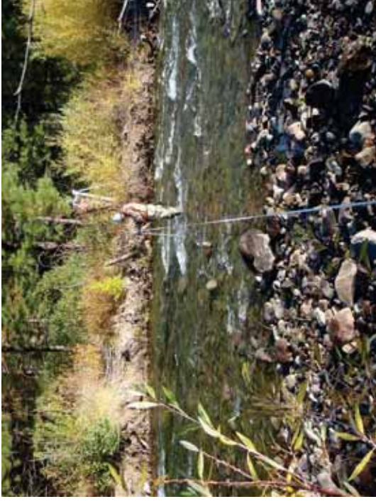
Figure 35. SR A1-RR: Transect 7 Riffle – From left bank looking to right bank.