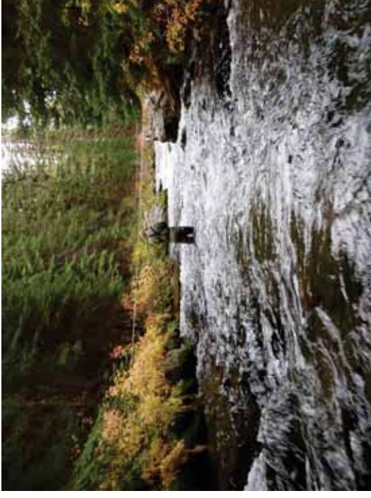
Figure 93. SR A1-RB: Transect 5 Rapid – From 30' downstream looking upstream.