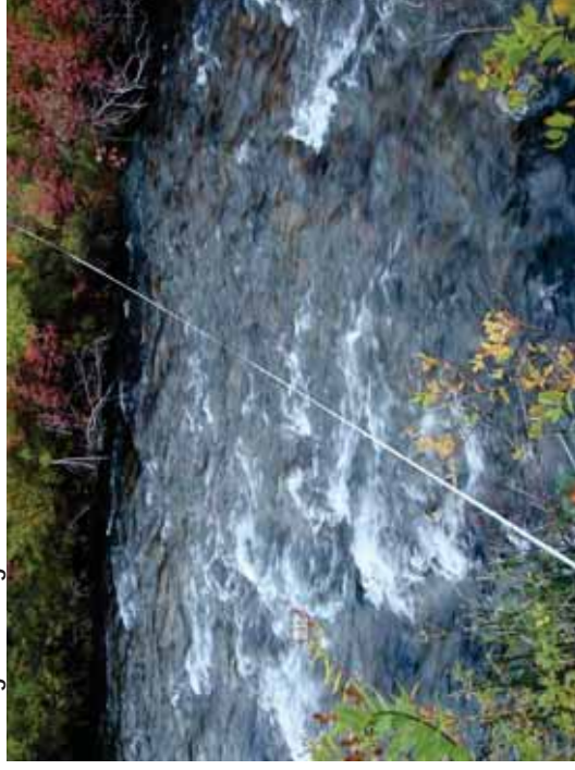
Figure 111. SR A2: Transect 4 Riffle – From left bank water's edge looking to right bank.