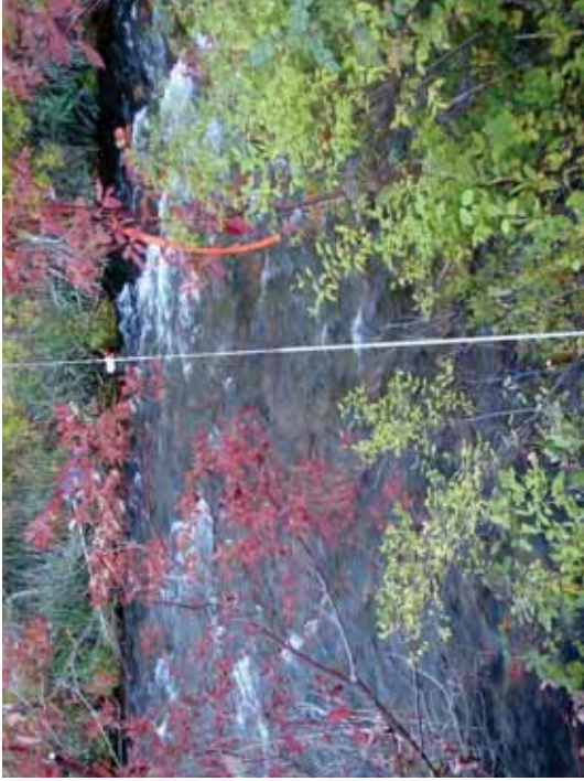
Figure 112. SR A2: Transect 4 Riffle – From right bank water's edge looking to left bank.