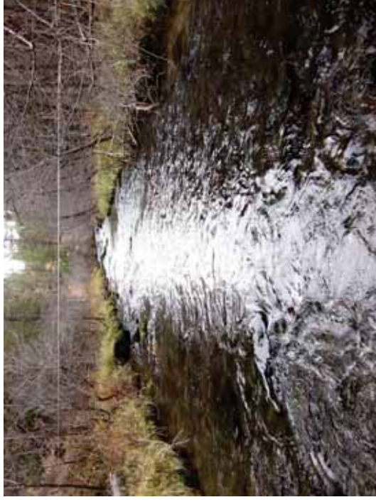
Figure 195. R B: Transect 6 Glide – From 20' downstream looking upstream.