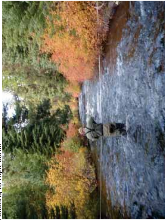
Figure 99. SR A1-RB: Transect 2 Riffle – From 10' downstream looking upstream.