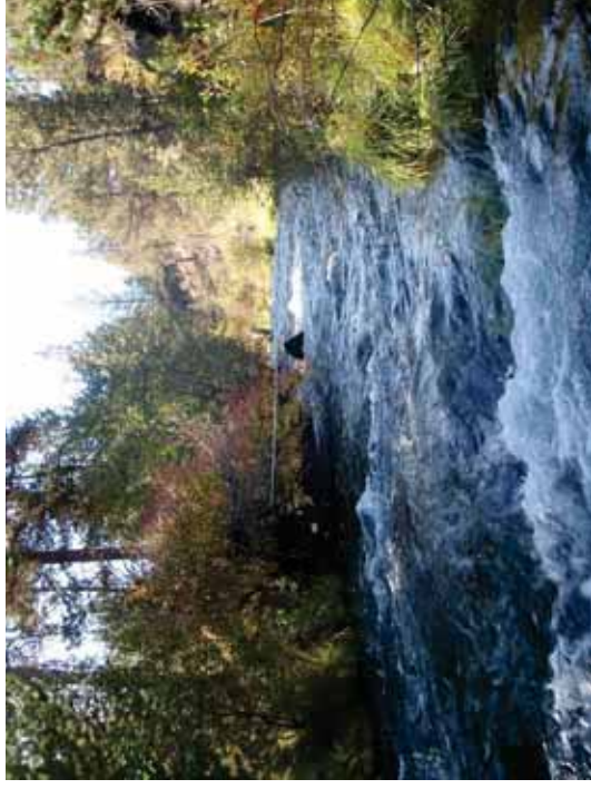
Figure 183. R B: Transect 2 Riffle – From 30' downstream looking upstream.