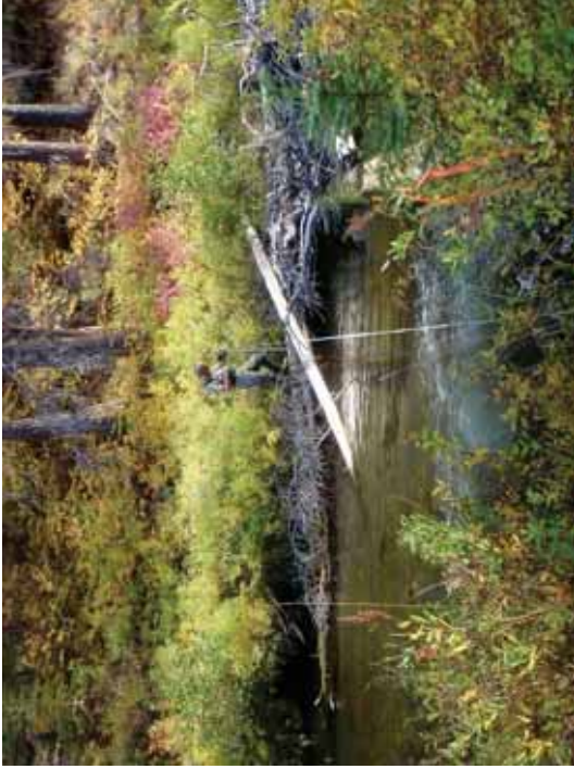
Figure 134. SR A2: Transect 2 Pool – From right bank looking to left bank.