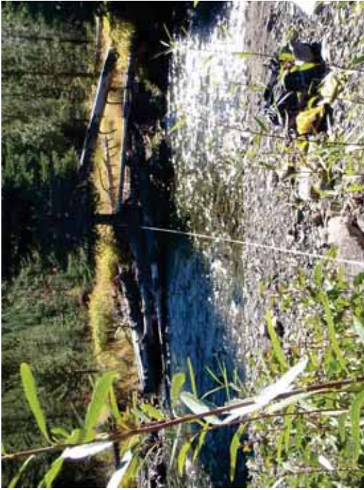
Figure 9. SR A1-RR: Transect 6 Riffle – From right bank tail pin looking to left bank.