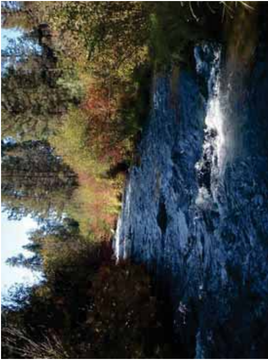
Figure 177. R B: Transect 4 Riffle – From 30' downstream looking upstream.