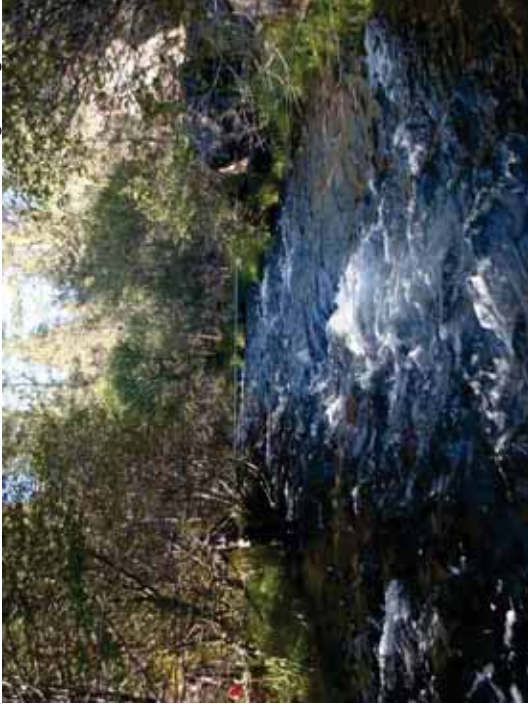
Figure 174. R B: Transect 5 Riffle – From 25' downstream looking upstream.