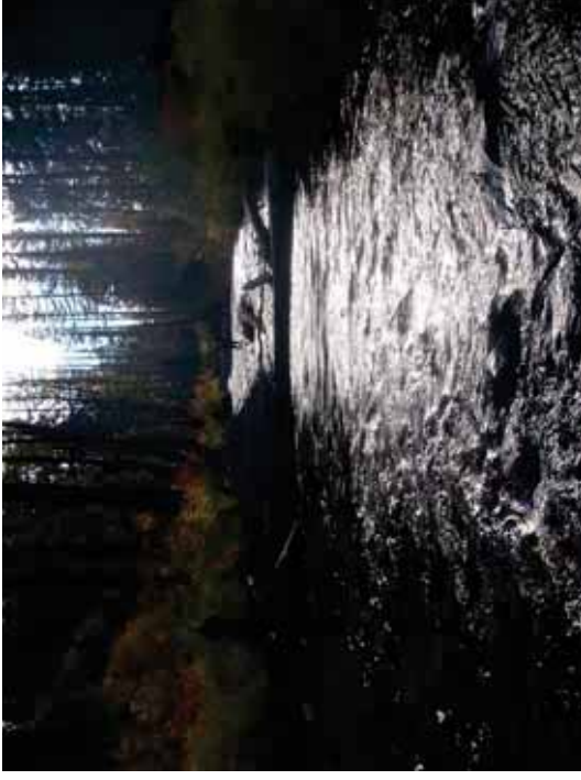
Figure 135. SR A2: Transect 2 Pool – From 20' downstream looking upstream.