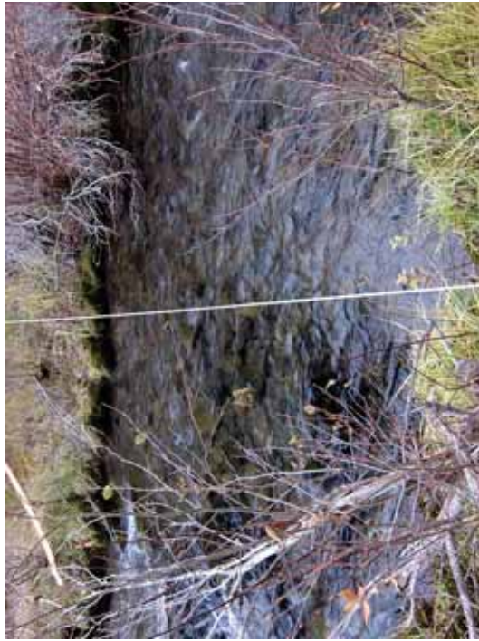
Figure 208. R B: Transect 2 Riffle – From right bank water's edge looking to left bank.