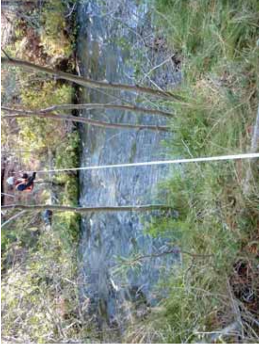
Figure 148. R B: Transect 6 Glide – From right bank looking to left bank.