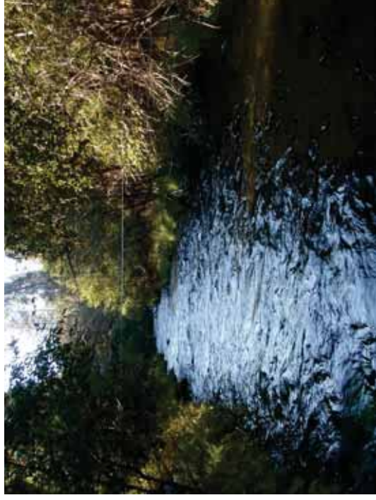
Figure 147. R B: Transect 6 Glide – From 20' downstream looking upstream.