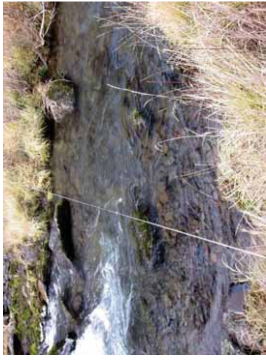
Figure 209. R B: Transect 1 Pool – From left bank looking to right bank.