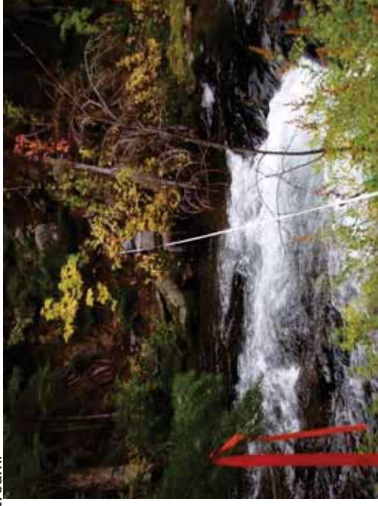
Figure 95. SR A1-RB: Transect 3 Plunge Pool – From right bank looking to left bank.