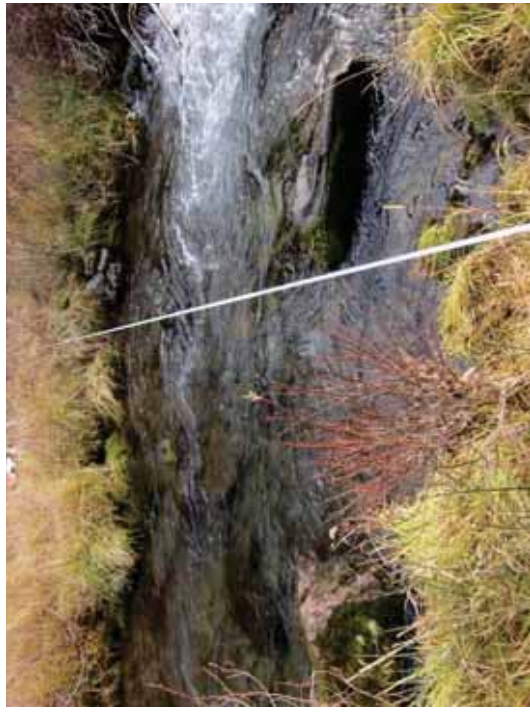
Figure 211. R B: Transect 1 Pool – From right bank looking to left bank.