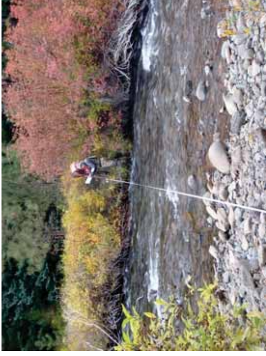
Figure 139. SR A2: Transect 1 Riffle – From left bank looking to right bank.