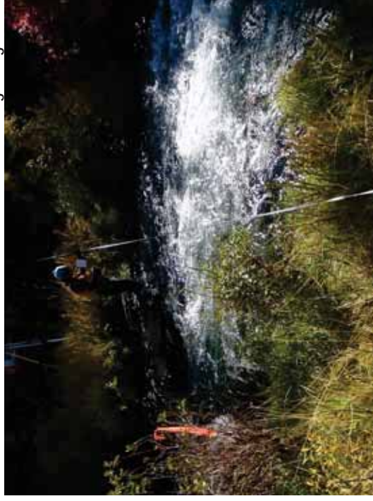
Figure 187. R B: Transect 1 Pool – From right bank looking to left bank.