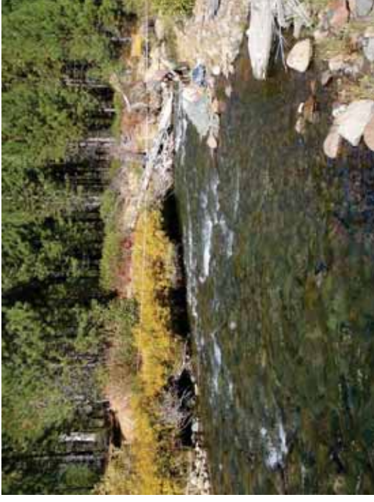
Figure 18. SR A1-RR: Transect 4 Riffle – From 20' upstream looking downstream.