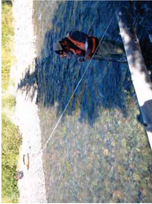
Figure 11. SR A1-RR: Transect 6 Riffle – From left bank water's edge looking to right bank.