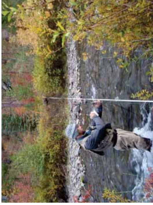
Figure 137. SR A2: Transect 1 Riffle – From right bank water's edge looking to left bank.