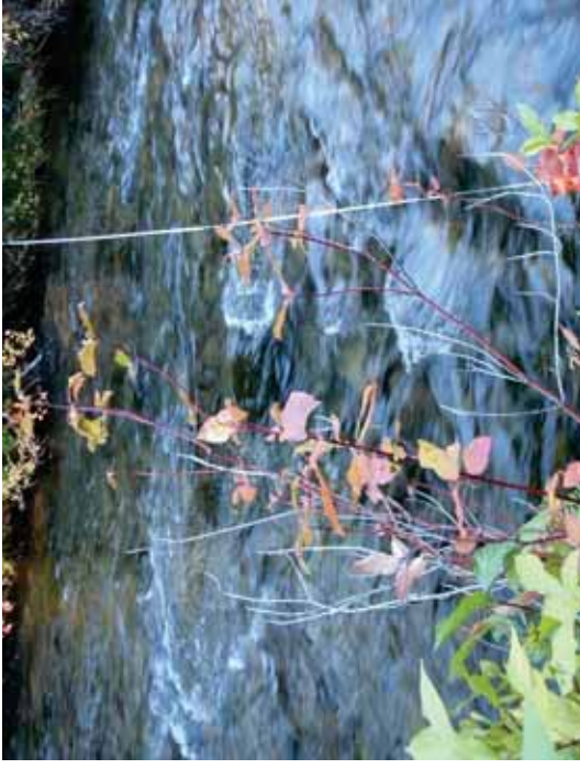
Figure 81. SR A1-RB; Transect 1 Riffle – From left bank water's edge looking to right bank water's edge.