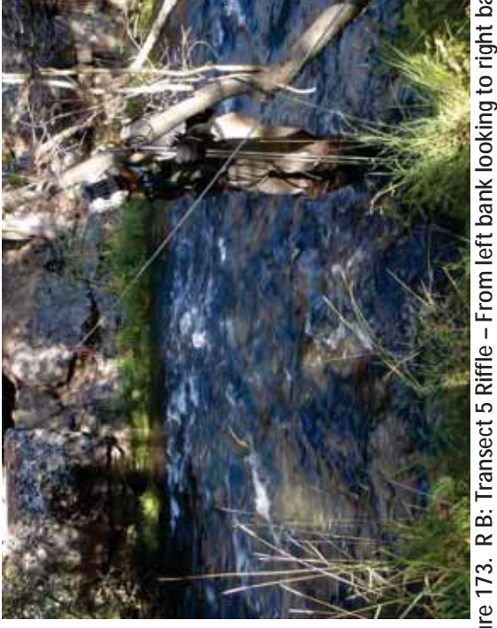
Figure 173. R B: Transect 5 Riffle – From left bank looking to right bank.