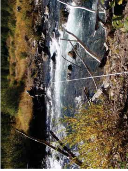
Figure 55. SR A1-RR: Transect 1 Riffle – From right bank tail pin looking to left bank.