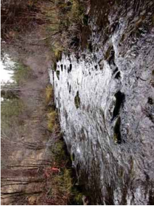
Figure 192. R B: Transect 7 Riffle – From 25' downstream looking upstream.