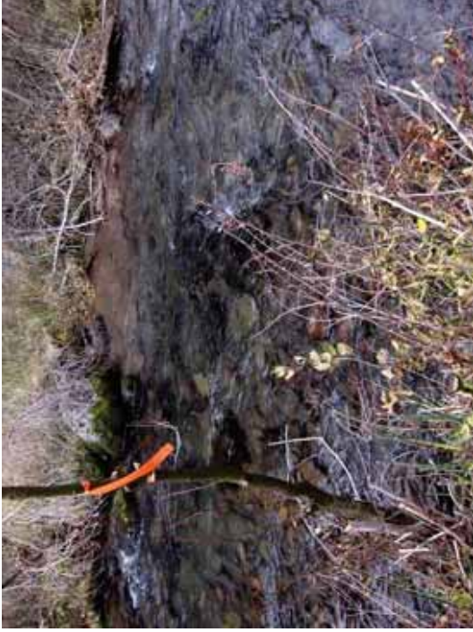
Figure 188. R B: Transect 8 Pool – From left bank water's edge looking to right bank.