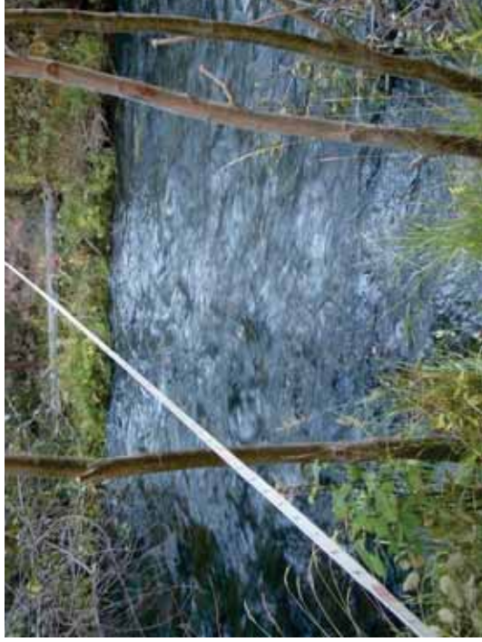
Figure 170. R B: Transect 6 Glide – From right bank water’s edge looking to left bank.