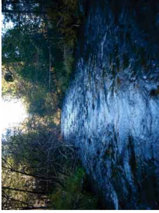
Figure 171. R B: Transect 6 Glide – From 30’ upstream looking downstream.