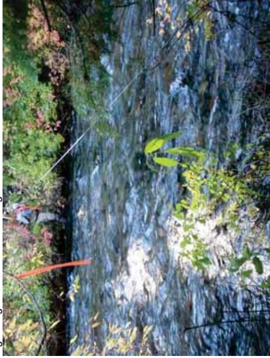
Figure 83. SR A1-RB; Transect 1 Riffle – From right bank water's edge looking to left bank.