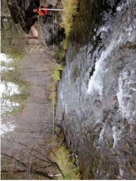
Figure 198. R B: Transect 5 Riffle – From 20' downstream looking upstream.