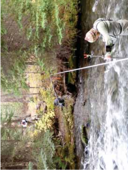
Figure 92. SR A1-RB: Transect 5 Rapid – From left bank water's edge looking to right bank.