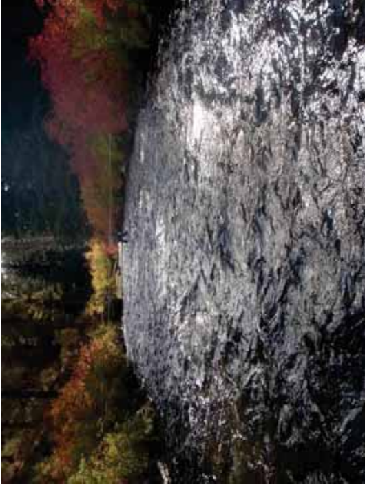
Figure 130. SR A2: Transect 4 Riffle – From 30' downstream looking upstream.