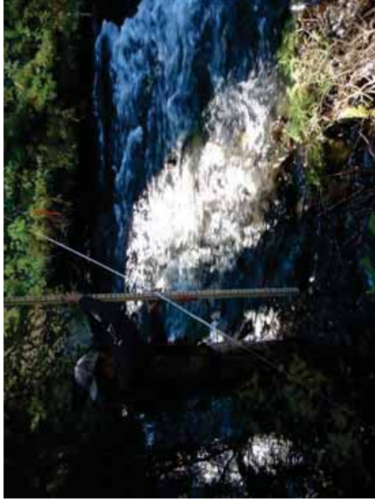
Figure 70. SR A1-RB: Transect 5 Rapid– From right bank looking to left bank.