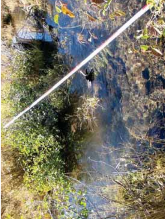
Figure 59. SR A1-RR: Transect 1 Side Channel – From right bank water's edge of side channel looking to left bank of side channel.