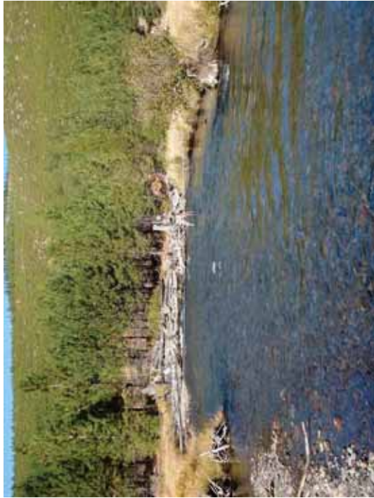
Figure 48. SR A1-RR: Transect 3 Riffle – From 40' upstream looking downstream.