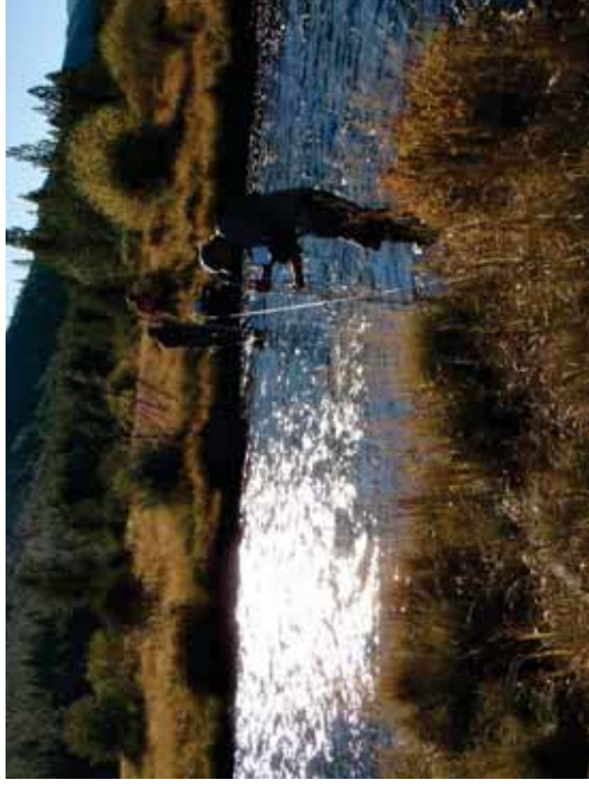
Figure 20. SR A1-RR: Transect 3 Riffle – From left bank head pin looking to right bank.