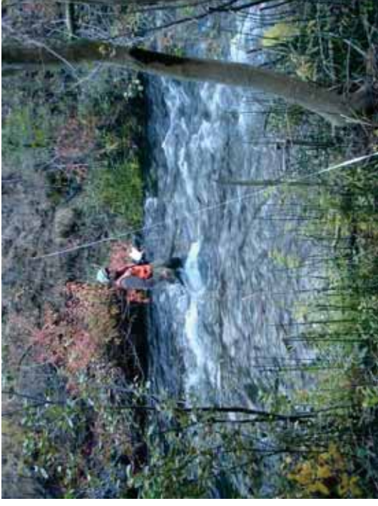
Figure 169. R B: Transect 7 Riffle – From right bank looking to left bank.