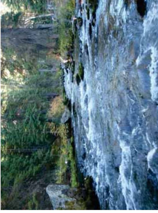
Figure 61. SR A1-RB: Transect 8 Pool – From 30' downstream looking upstream.