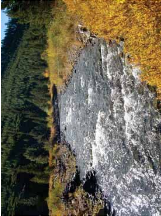
Figure 46. SR A1-RR: Transect 4 Riffle – From 20' downstream looking upstream.