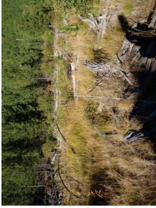
Figure 24. SR A1-RR: Transect 2 Dewatered Habitat – From left bank head pin looking toward right bank.