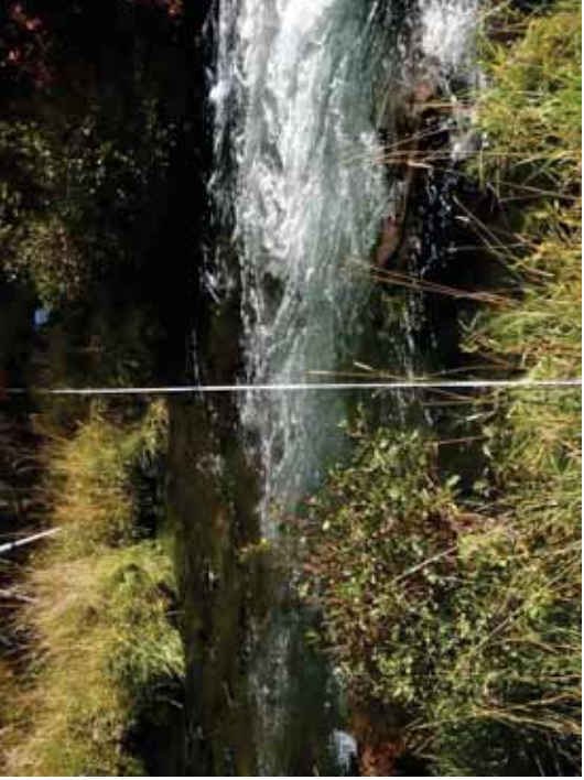
Figure 162. R B: Transect 1 Pool – From right bank looking to left bank.