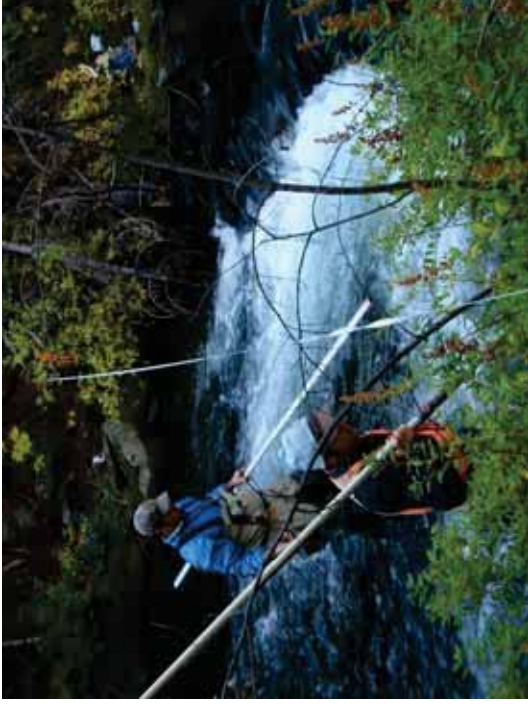
Figure 77. SR A1-RB: Transect 3 Plunge Pool – From right bank looking to left bank.