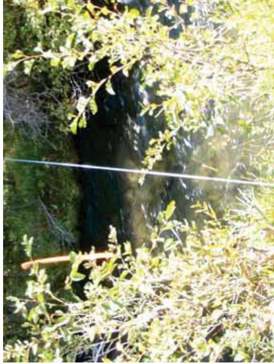
Figure 158. R B: Transect 2 Riffle – From right bank looking to left bank.