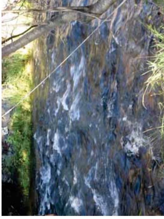
Figure 151. R B: Transect 5 Riffle – From left bank water's edge looking to right bank water's edge.