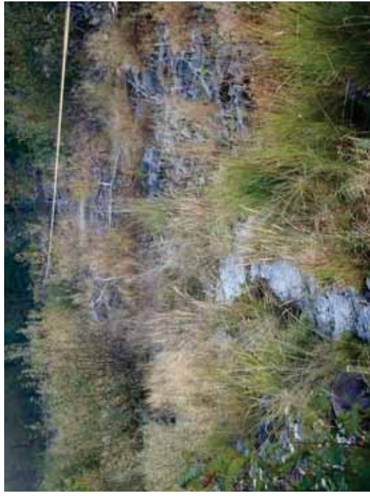
Figure 31. SR A1-RR: Transect 8 Side Channel – From right bank of side channel looking to left bank of side channel.