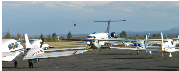
Third Busiest Airport in Oregon

The City of Bend has prepared a Draft Environmental Assessment in conformance with the requirements of the National Environmental Policy Act of 1969 (NEPA) and FAA Order 1050.1F, Environmental Impacts: Policies and Procedures. The Draft Environmental Assessment analyzes the potential environmental impacts that may result from construction and operation of the proposed new Airport Traffic Control Tower. An Environmental Assessment is a concise document used to describe a Proposed Action's anticipated environmental impacts. As stated in FAA Order 1050.1F Paragraph 3-1.2, the purpose of an Environmental Assessment is to determine whether a Proposed Action has the potential to significantly affect the human environment.