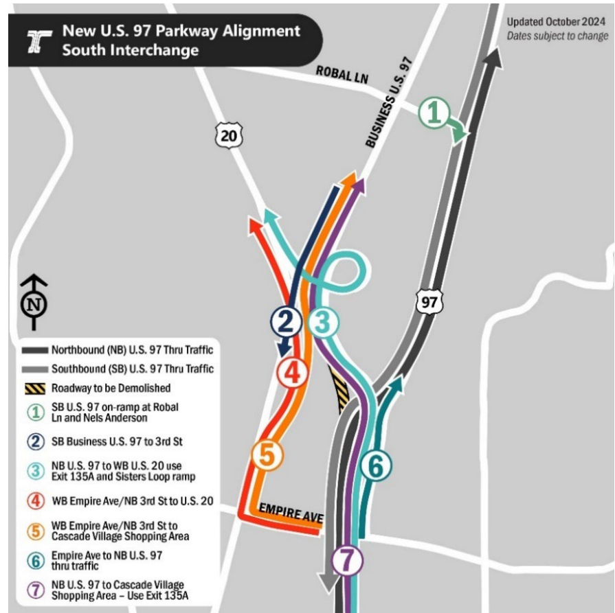
FIGURE 1: US97 AND US20 BEND NORTH CORRIDOR PROJECT.

The project involved multiple improvements, intended to mitigate increased congestion and related safety issues (following rapid population growth in the area over the past decade), at the north end of Bend. Focus areas for the improvements included enhancing safety, reducing traffic volumes, congestion, and speeds at busy intersections, adding bicycle and pedestrian facilities, and increasing/improving neighborhood access, quality of life, movement of goods, and travel times. To learn more about this project, visit ODOT's Bend North Corridor Project (US20 and US97) webpage .