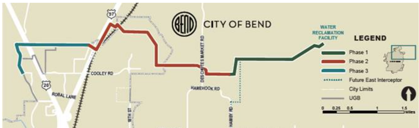
North Interceptor Alignment

Phase III: TBD, Clausen Road to O.B. Riley Road.