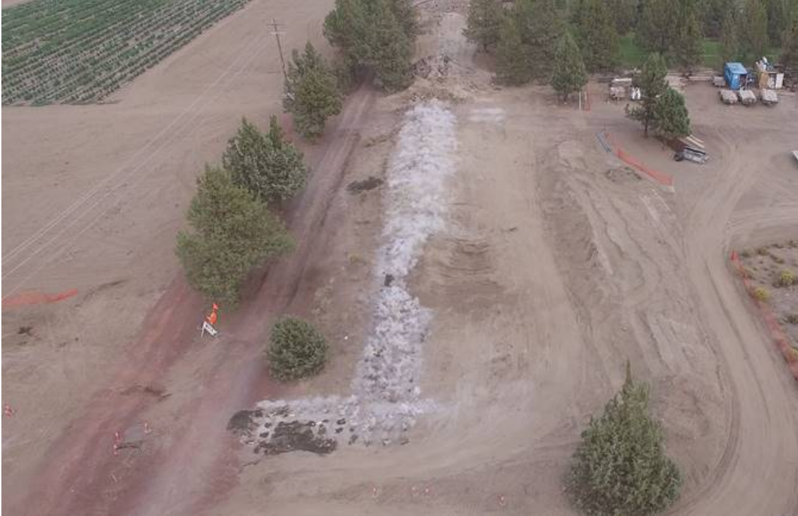
Blasting along Margaret Lane