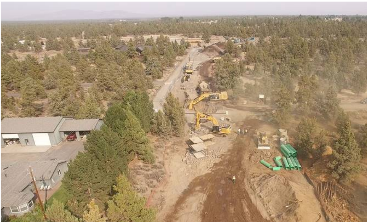
Pioneer Loop Crossing