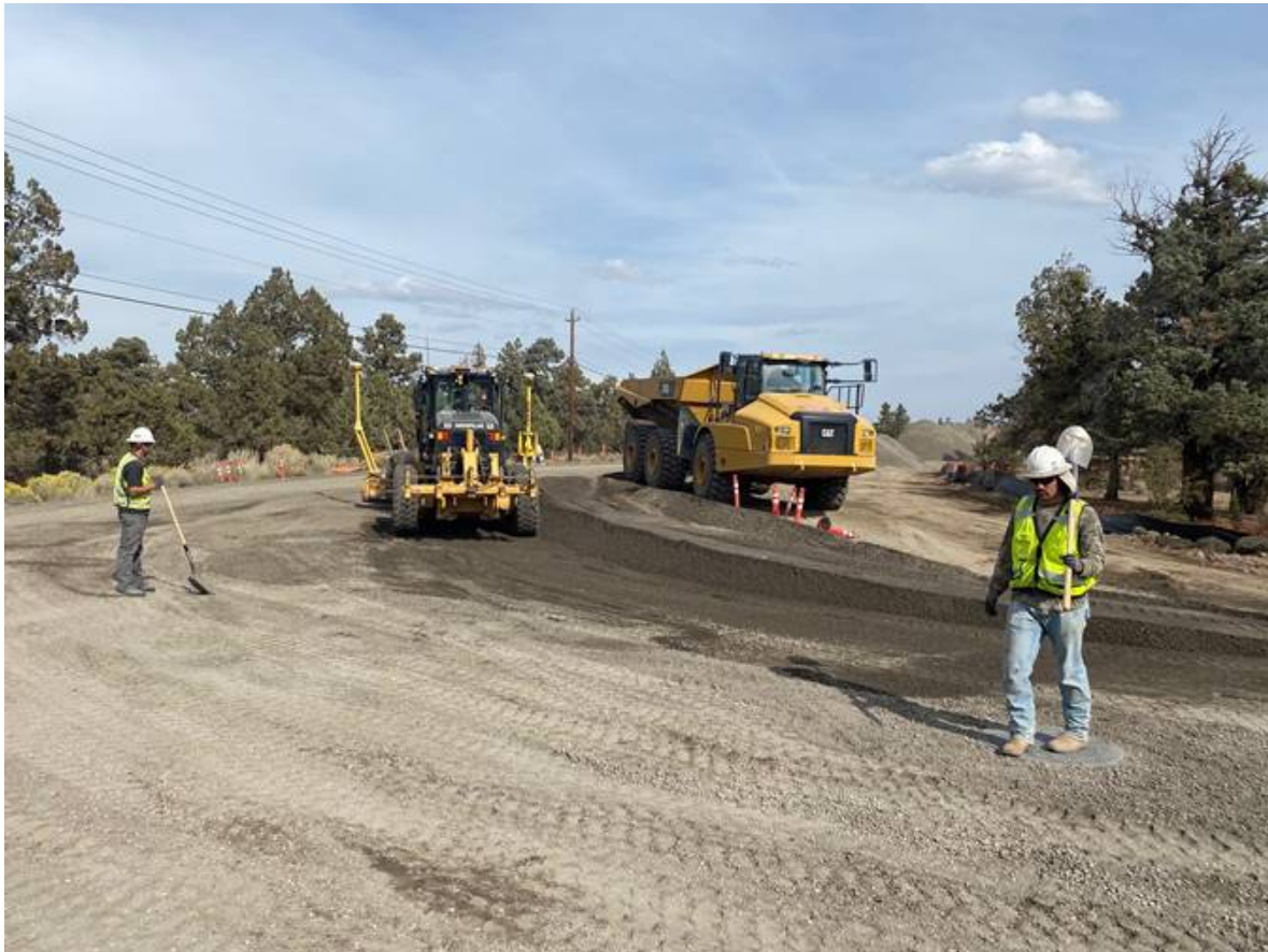
Pioneer Loop Restoration