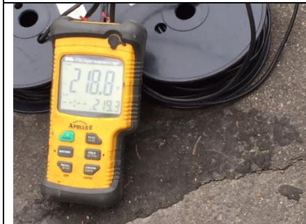
Photo 6: Temperature sensor monitoring sewer line temperature during resin curing.