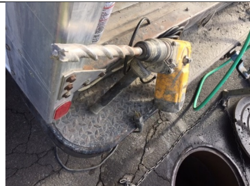
Photo 2: Hammer drill used for concrete drilling during step installation

This report is advisory only. It may not list all existing hazards. SAIF assumes no responsibility for correction of conditions identified as hazardous. Safety remains your responsibility.