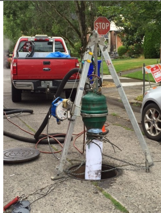
Photo 3: Liner sleeve (helps guide liner through pipe) and liner feed into sewer line.