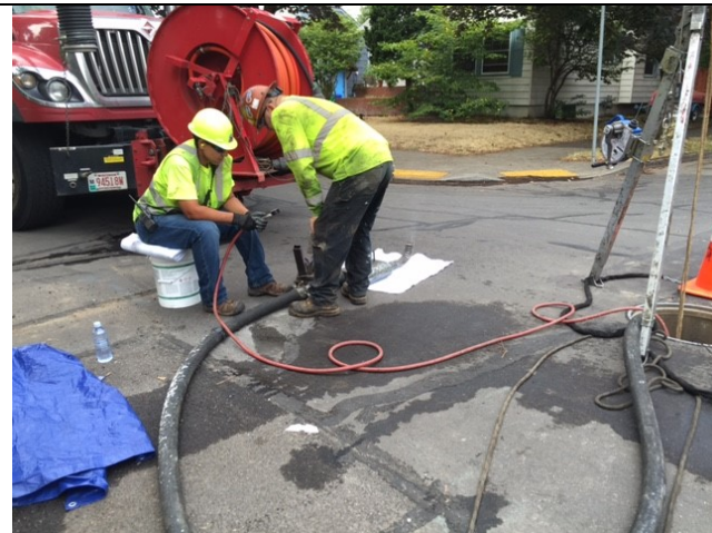
Photo 4: End of sewer line, monitoring air pressure. Steam not coming up to pressure (before steam generator change-out).

This report is advisory only. It may not list all existing hazards. SAIF assumes no responsibility for correction of conditions identified as hazardous. Safety remains your responsibility.