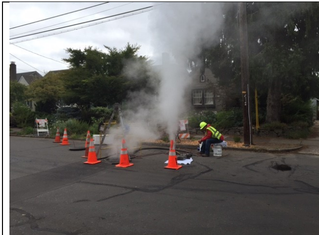
Photo 5: Steam exhausting out of end of line manhole and exhaust manifold during resin curing.