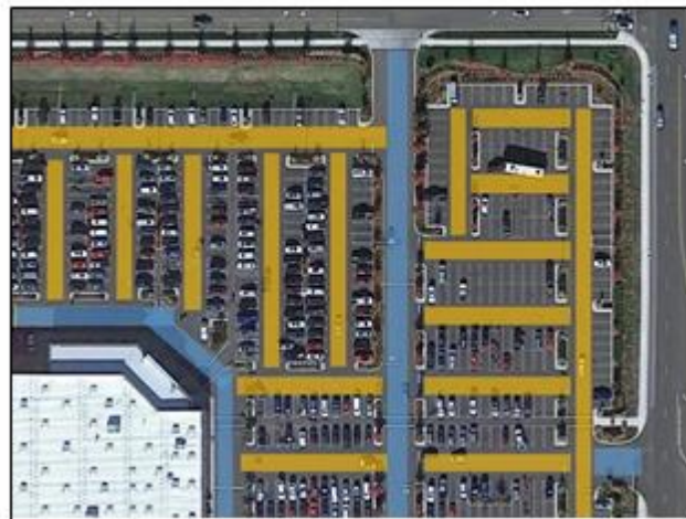
Parking Lot Driveways (Blue) and Drive Aisles (Orange)